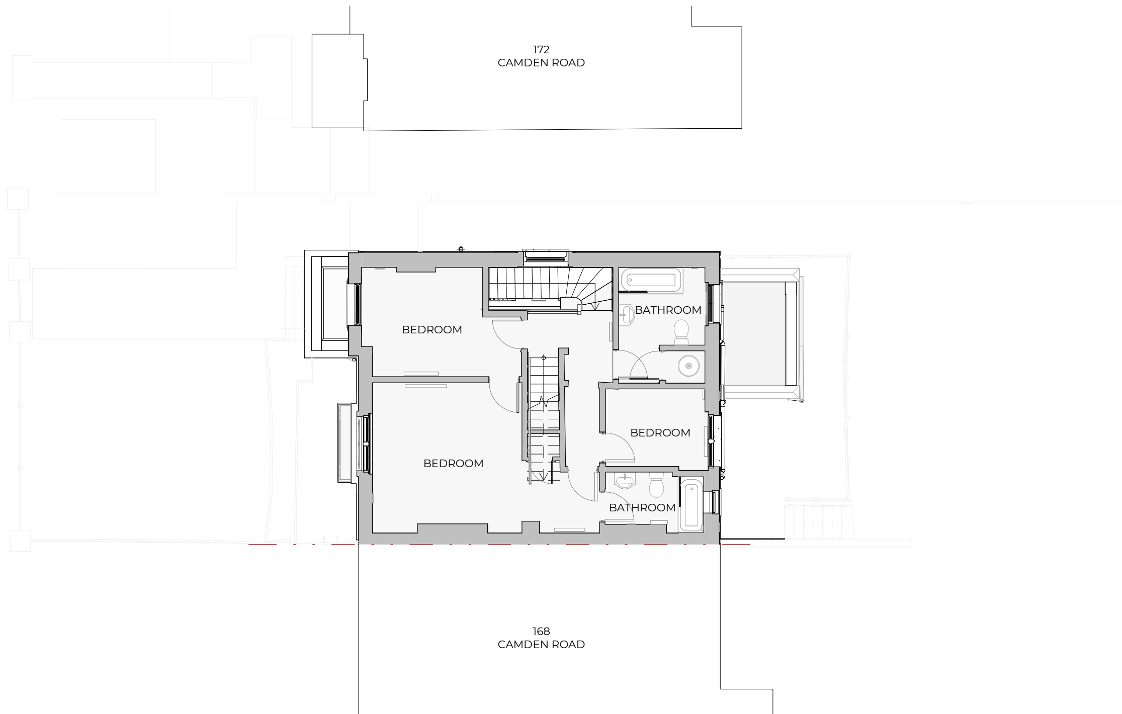
Existing First Floor