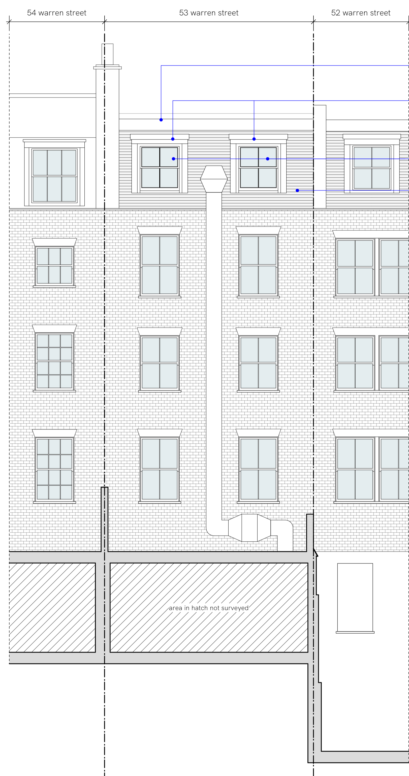
REAR ELEVATION AS PROPOSED SCALE 1:50 @A1