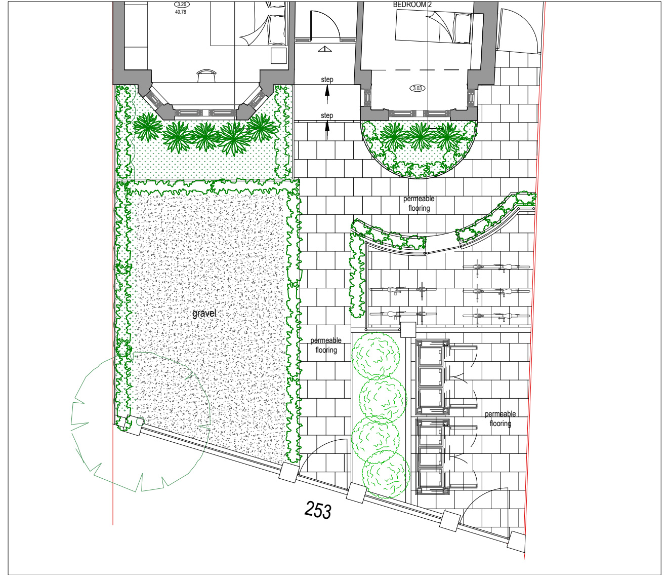
2 Proposed Front Area scale 1:100