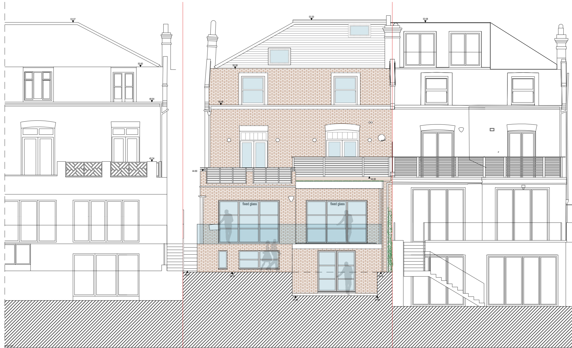
1 Rear Elevation in context scale 1:100