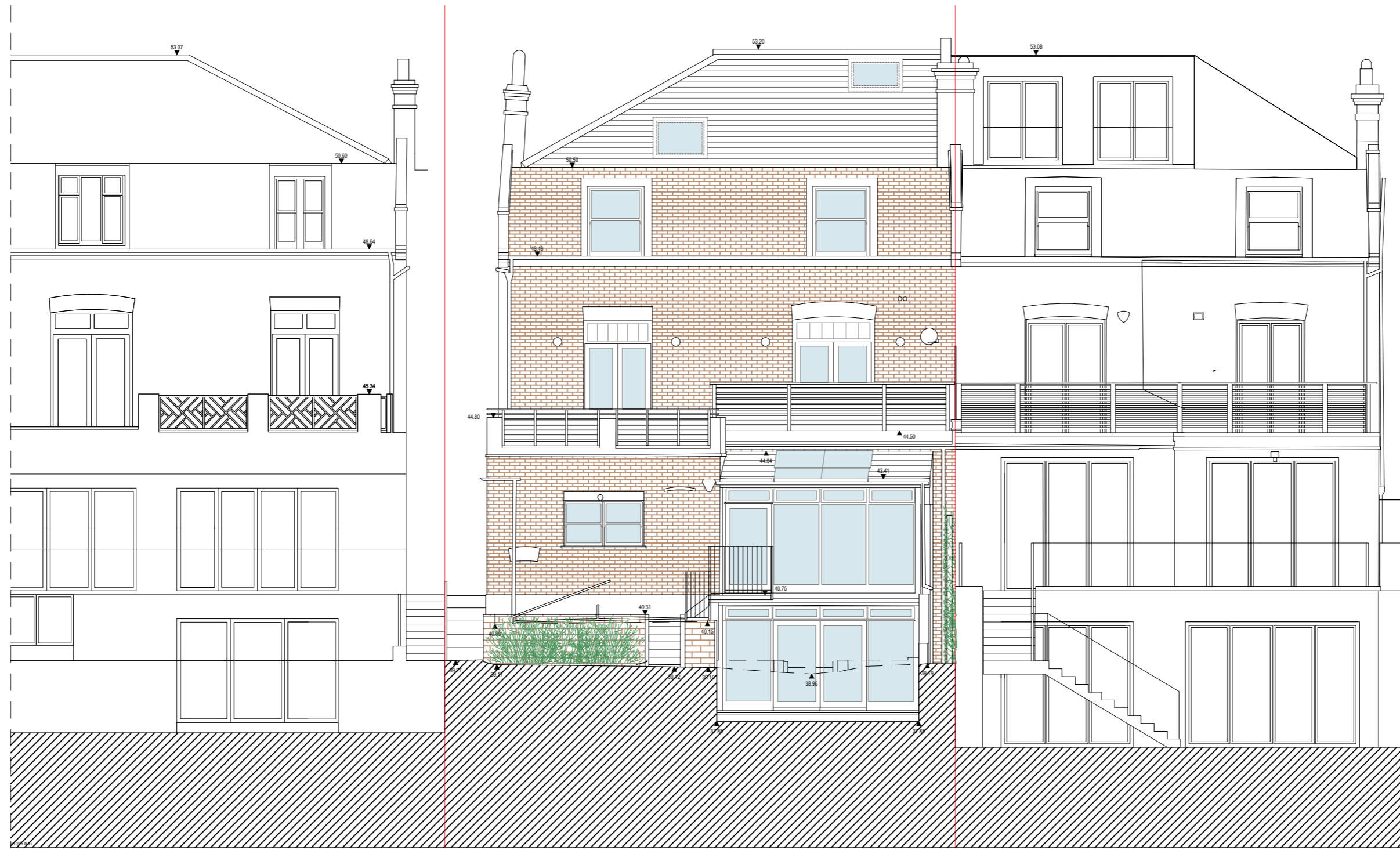
1 Rear Elevation in context scale 1:100