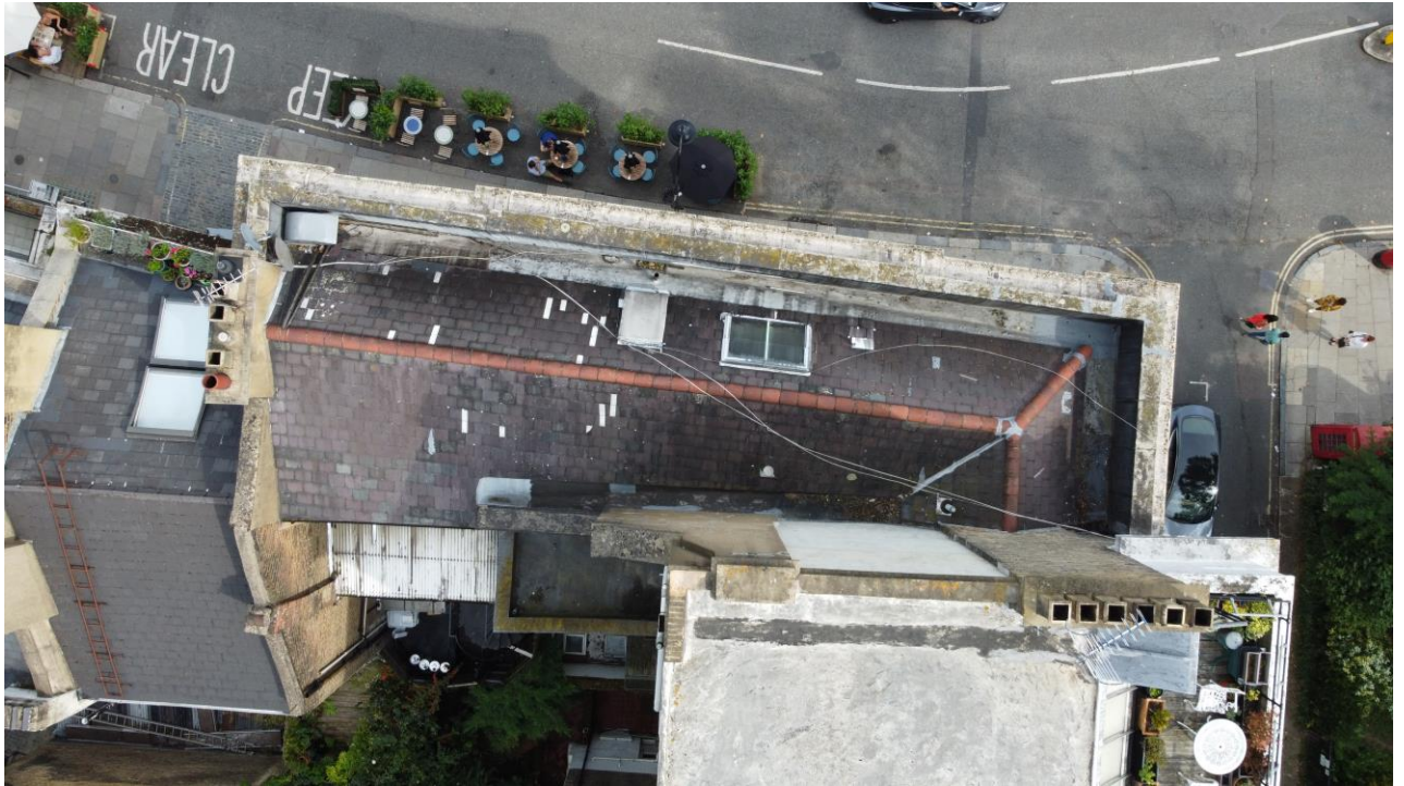
Photo C - Existing Aerial Photo