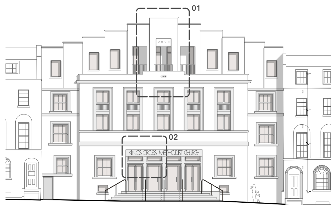
KEY ELEVATION - NOT TO SCALE