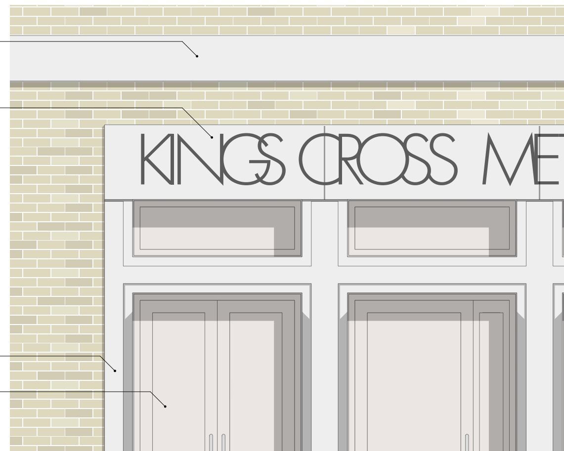
PROPOSED ELEVATION DETAIL 02