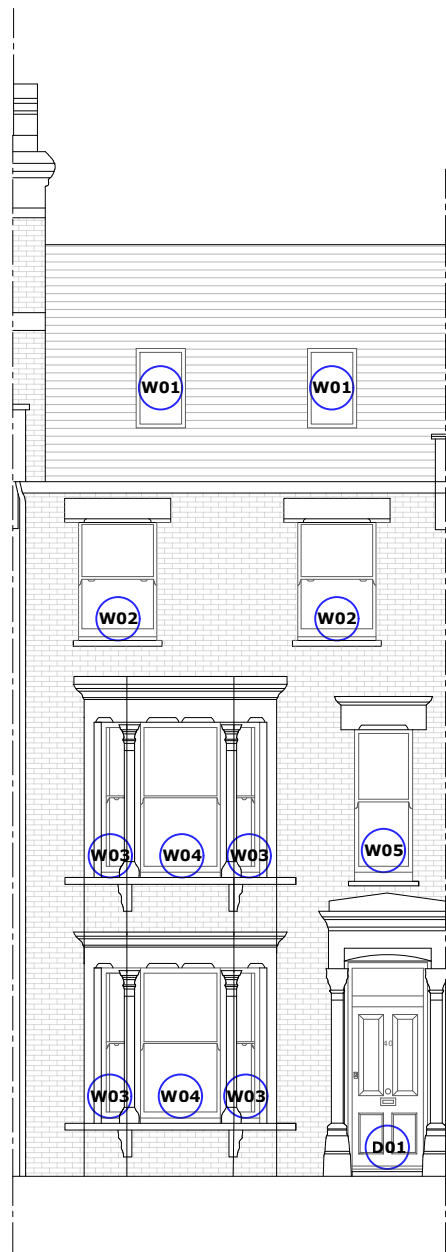
1 Proposed West Elevation Scale: 1:100 @ A3