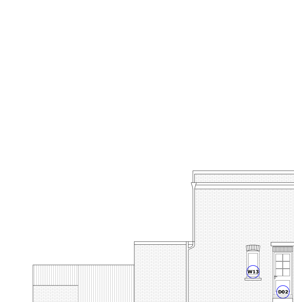
3 Existing South Elevation