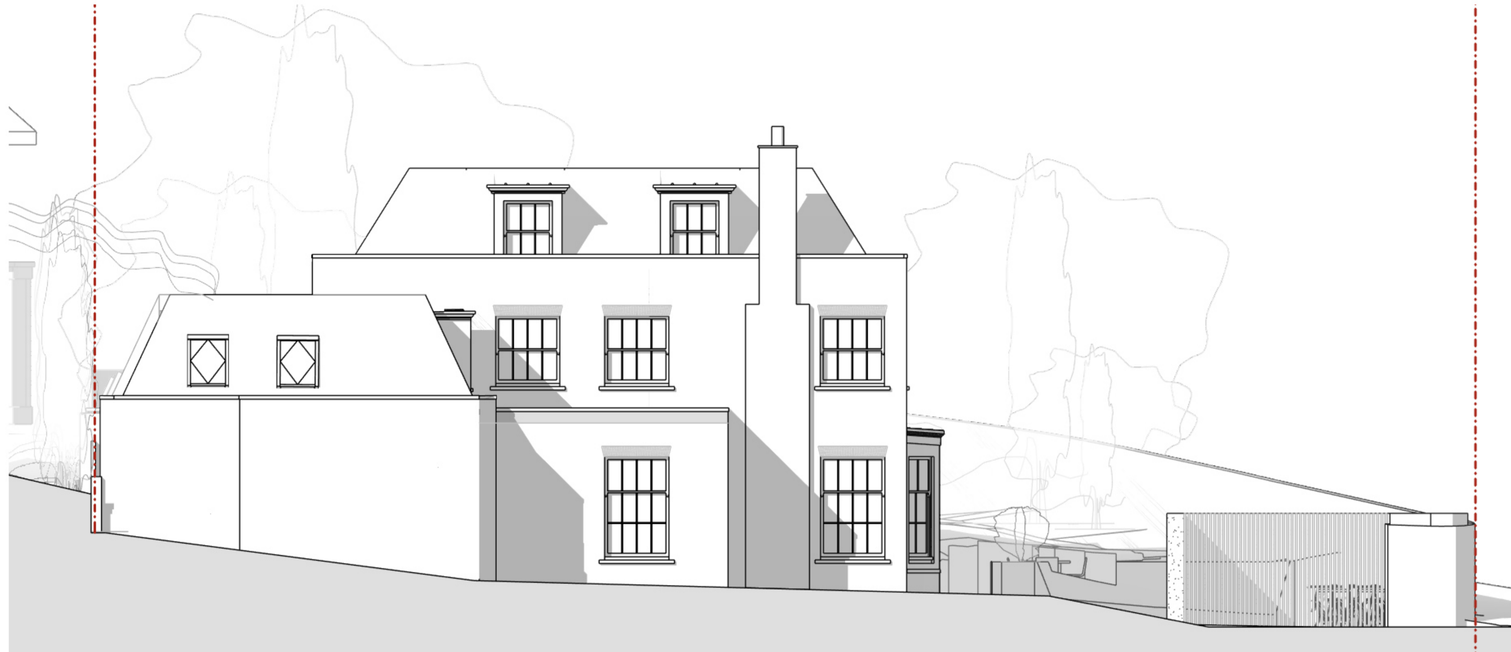
1 Proposed West Elevation 1 : 50