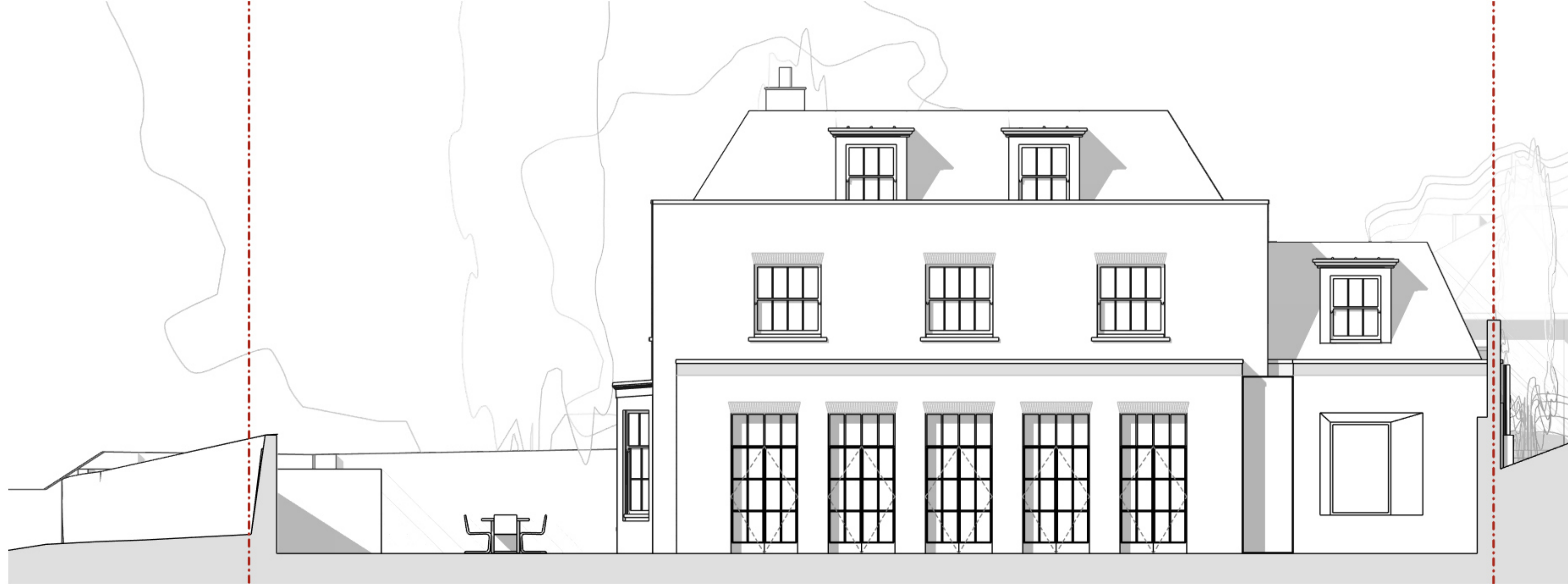
2 Proposed East Elevation (Garden) 1 : 50