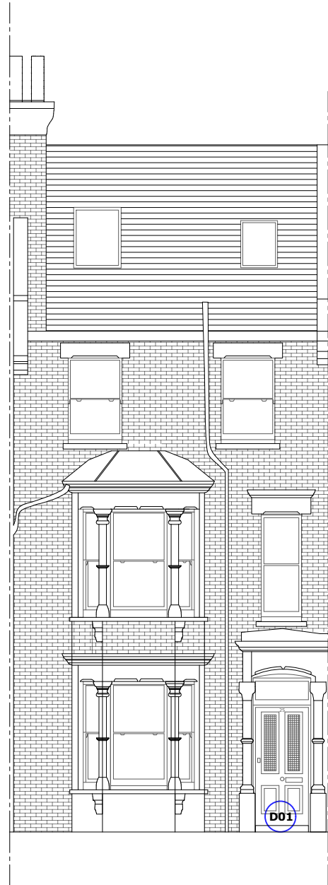
1 Existing East Elevation Scale: 1:100 @ A3