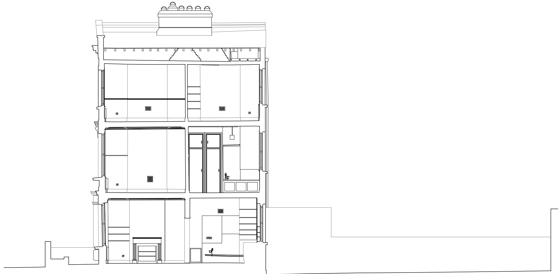
EXISTING SECTION BB scale 1:100