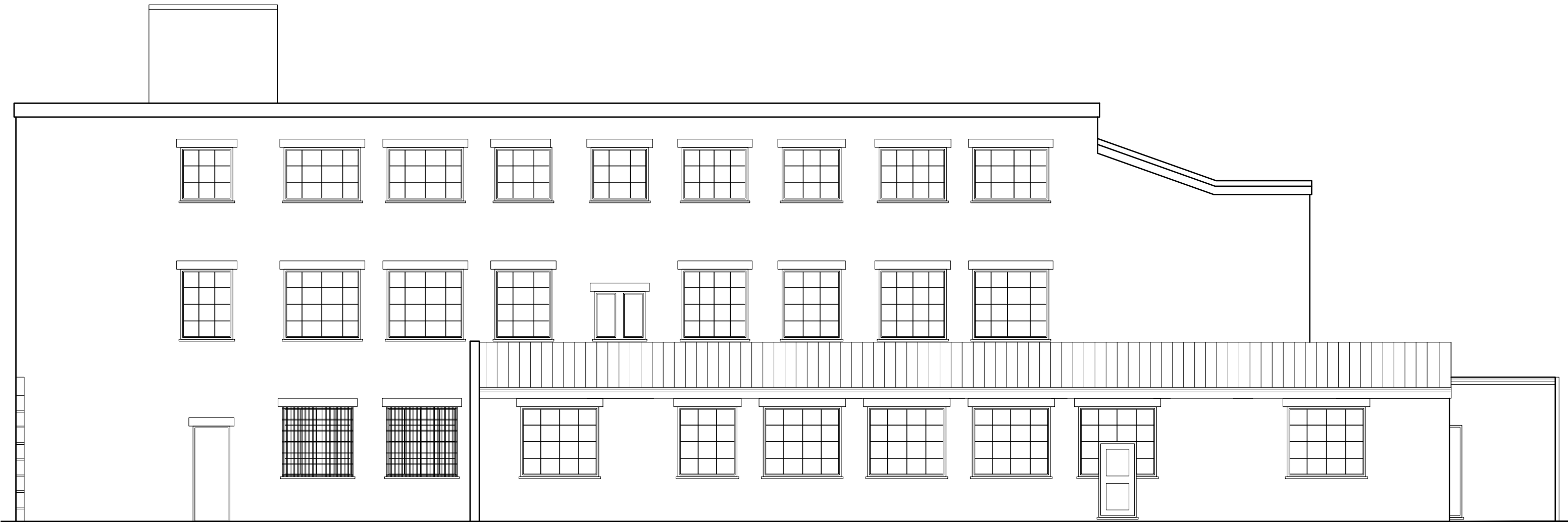
1 Existing Side Elevation (north-west facing) Scale: 1/100