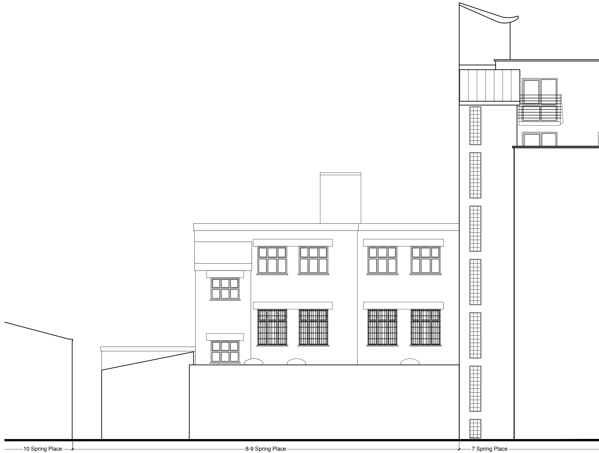
1. Existing Rear Elevation Scale: 1/100