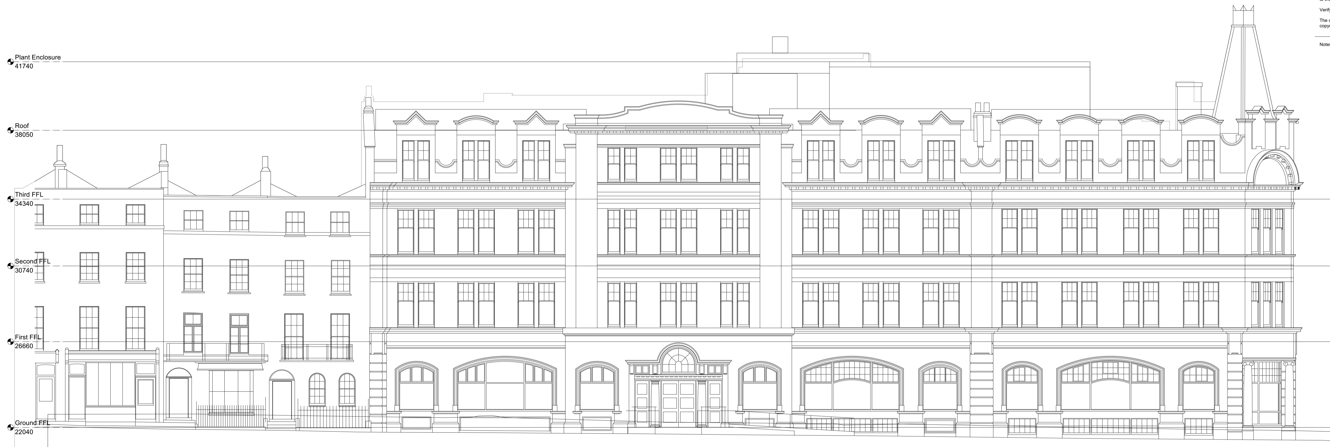
1 EXISTING EAST ELEVATION Scale: 1:100