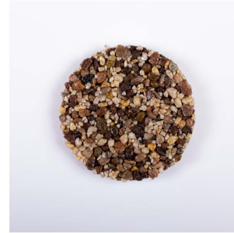
12 PEARL JAM RESIN TO FRONT AREA