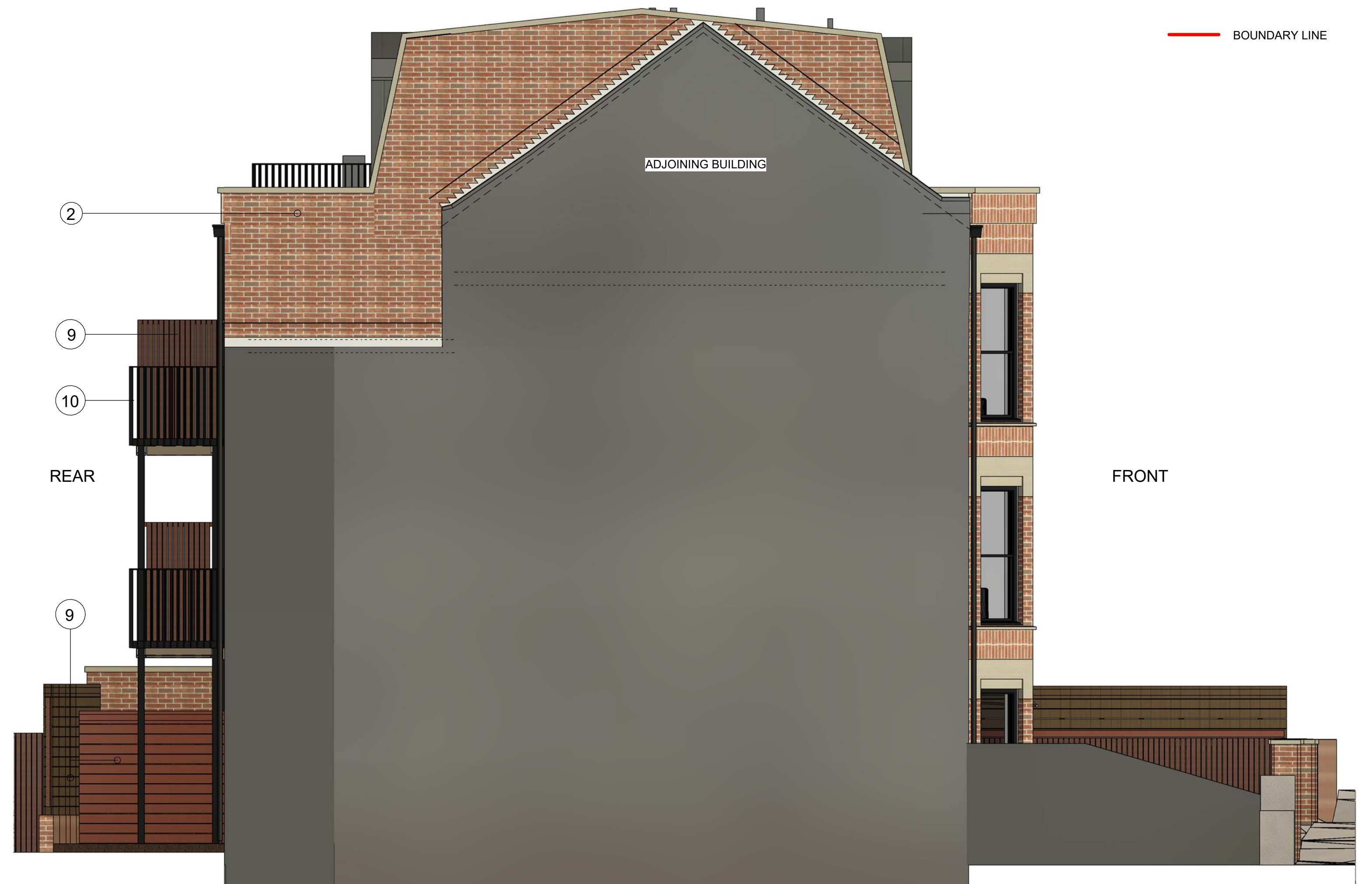
South Elevation - Condition No.03