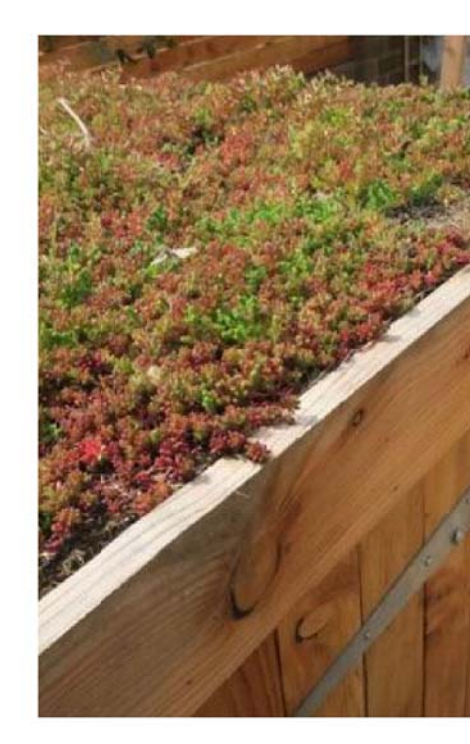
8 TIMBER BIKE STORE WITH GREEN ROOF