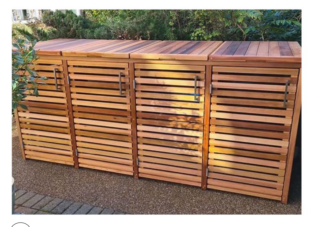
INDIVIDUAL ACCESS TIMBER BIN STORE

(3) (FRONT FACADE) TIMBER FRAME DOUBLE GLAZED - BLACK PAINTED SASH WINDOWS