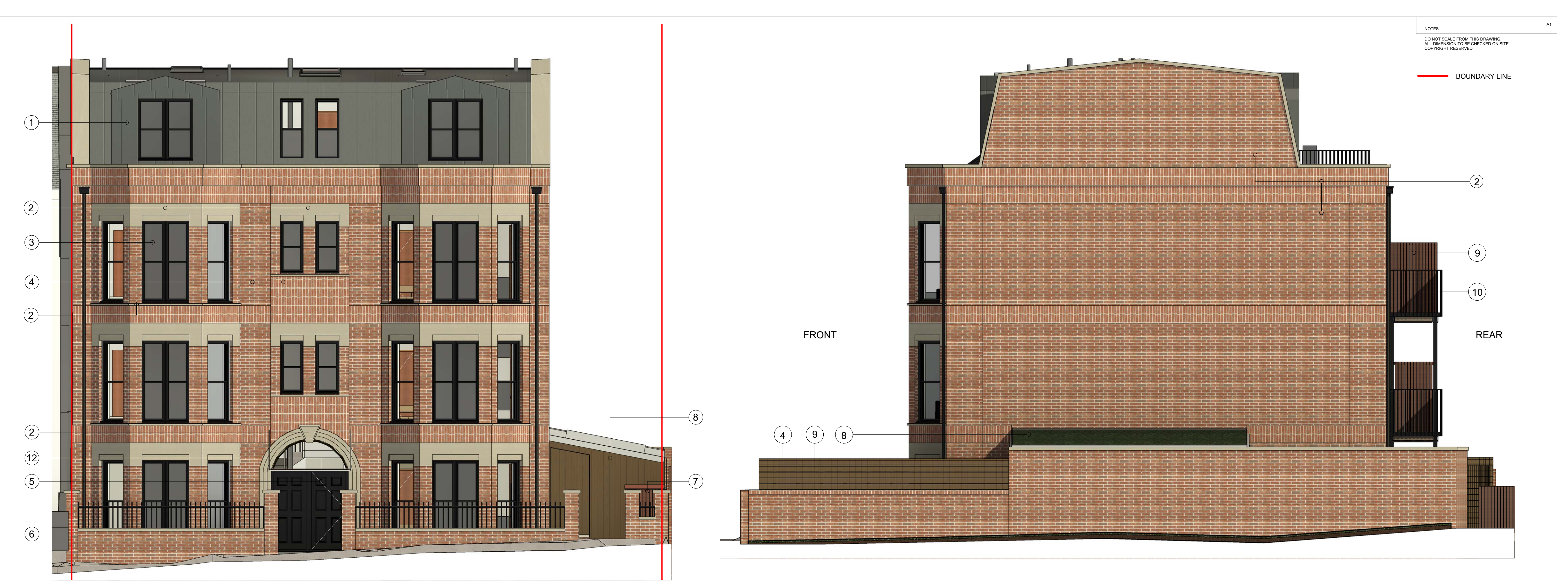
Front Elevation - Condition No.03