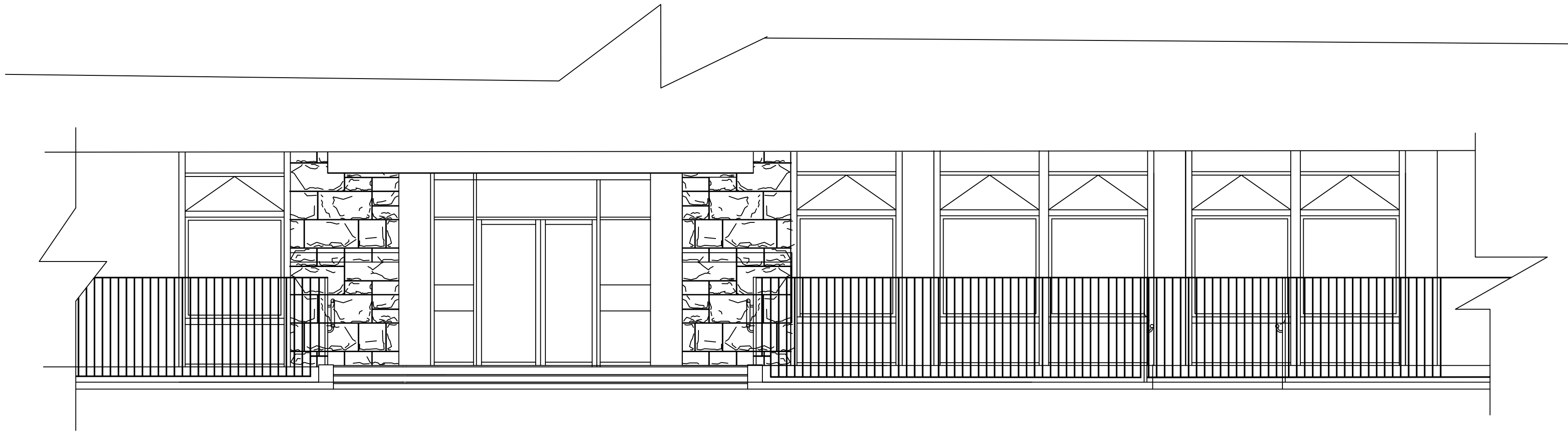
As Existing Drawing 1:50