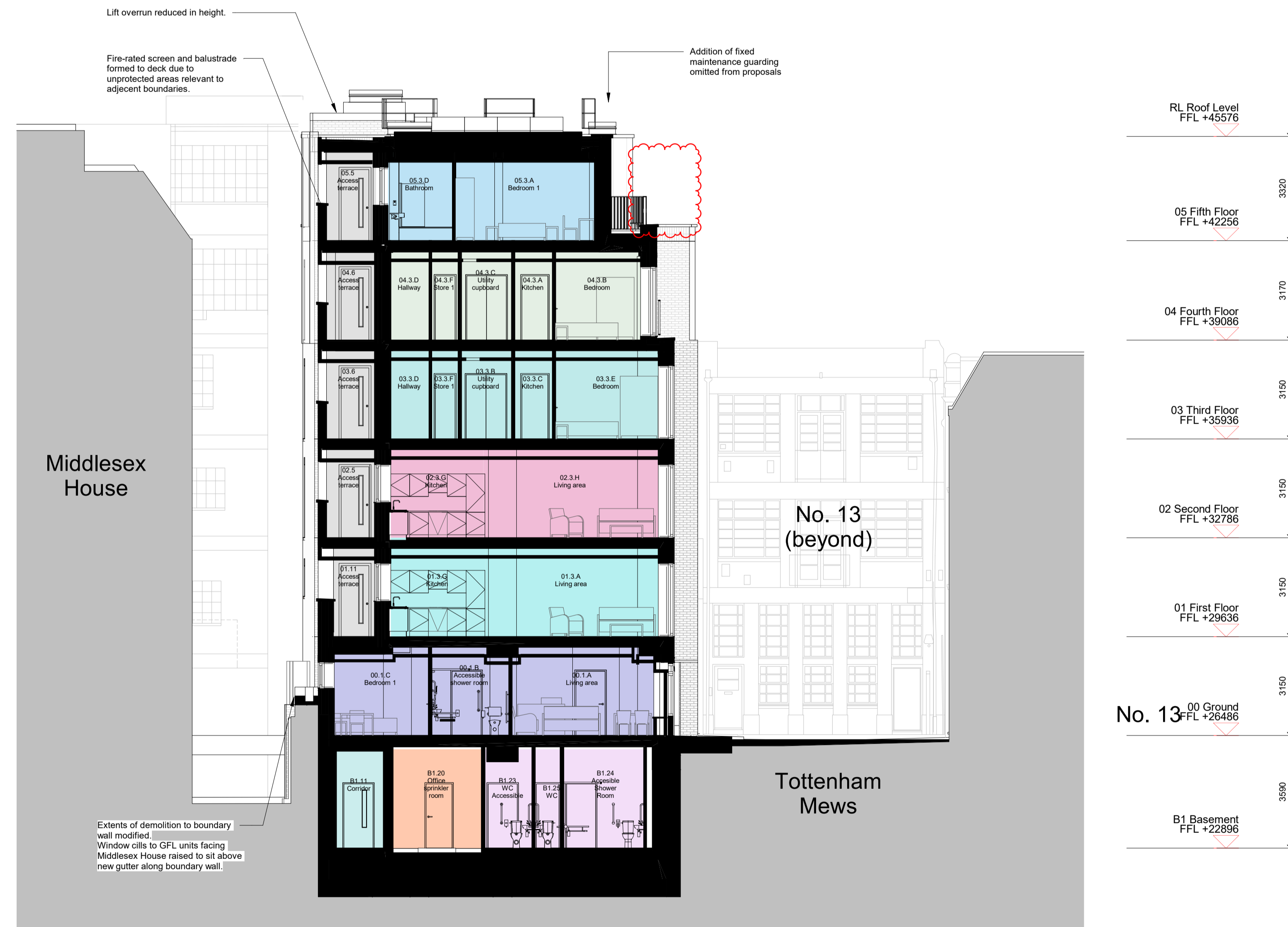
AA Proposed Section AA 1 : 100

General Notes: A FULL Planning application, reference: 2020/5633/P, was consented on 12 April 2022 for the following works: Erection of a six storey building (and basement) to provide office (use Class E) at part ground and basement levels and self-contained flats (use class C3) at ground and floors one to five, with associated landscaping, cycling parking and enabling works.