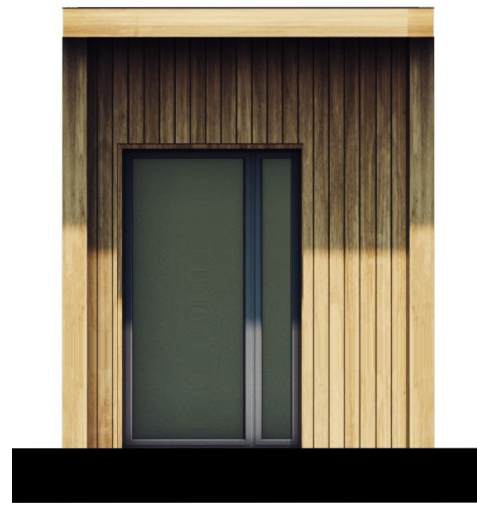
North-West Elevation Scale: 1:50