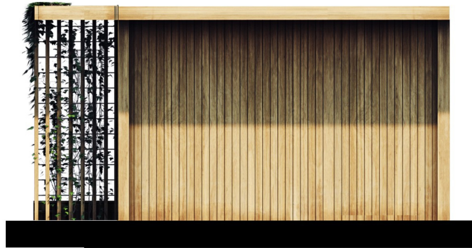
SOUTH ELEVATION Scale: 1:50