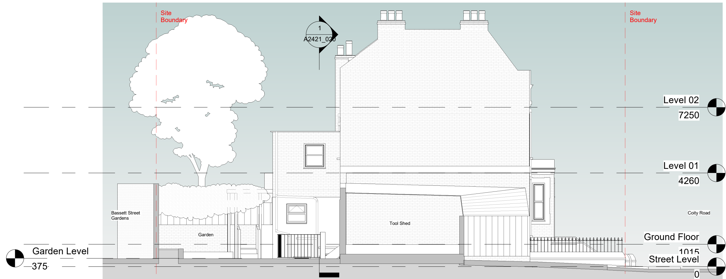
Proposed Section C-C