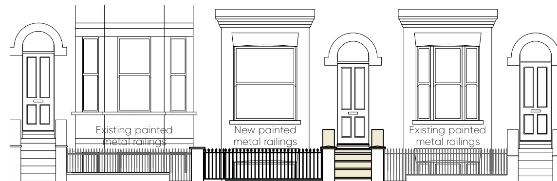
New york stone treads risers paving & cappings