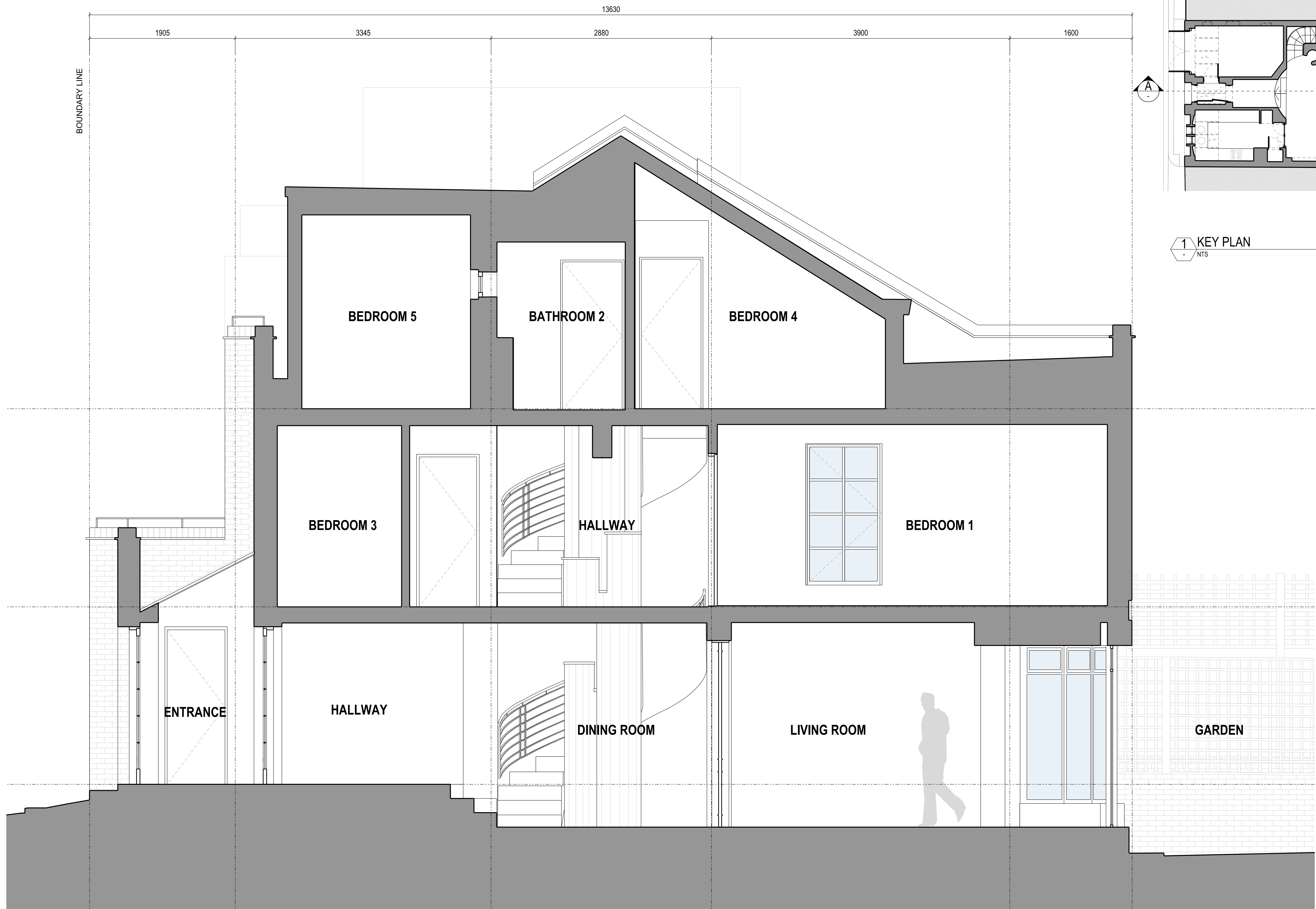
1 KEY PLAN NTS