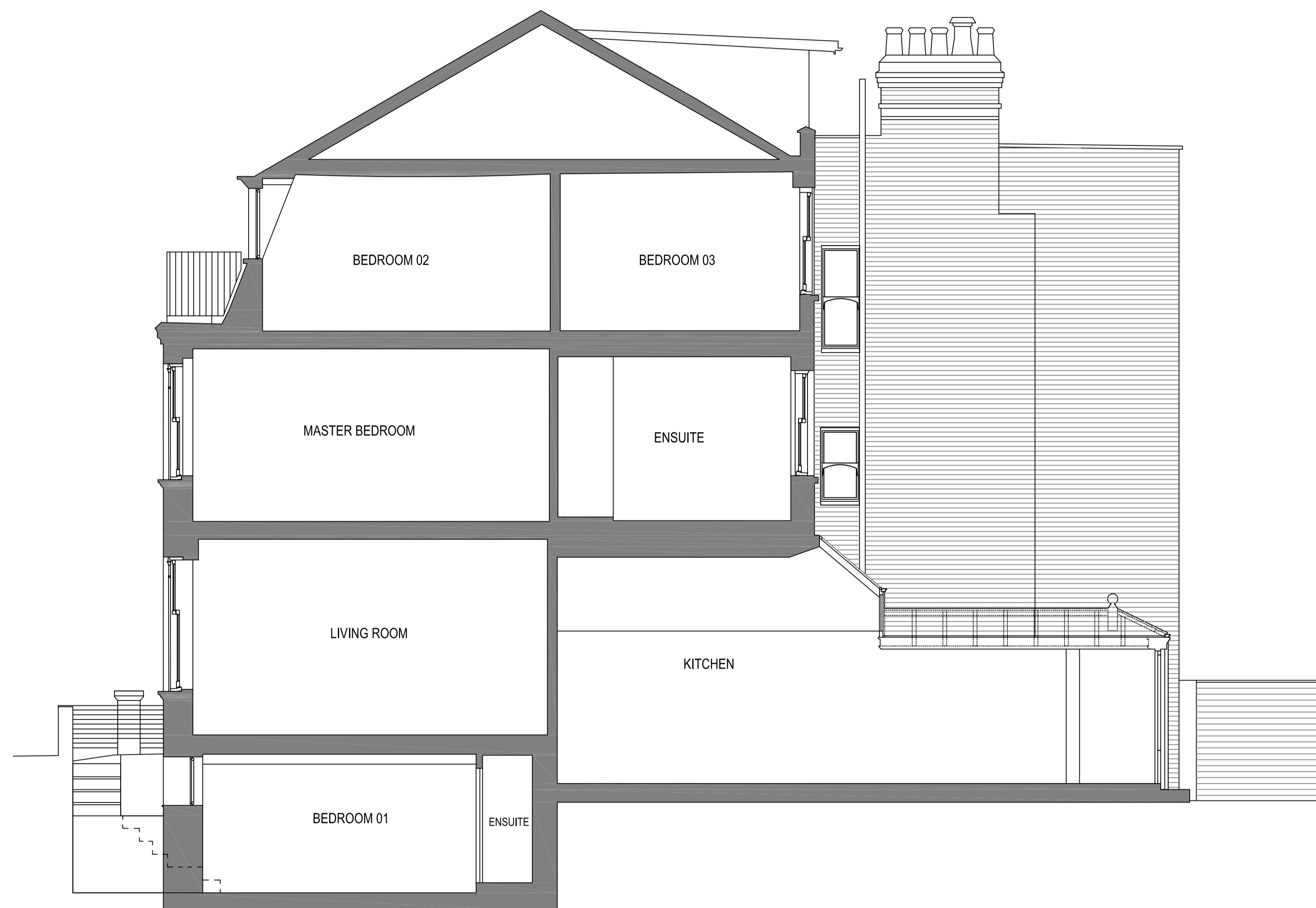
EXISTING SECTION B-B