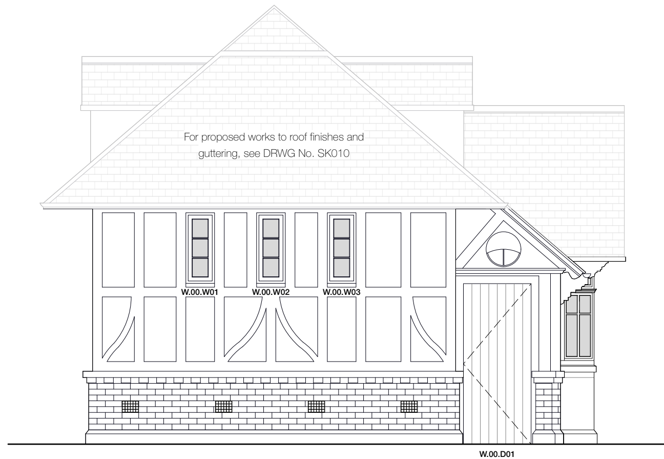
WEST ELEVATION AS PROPOSED 1:50