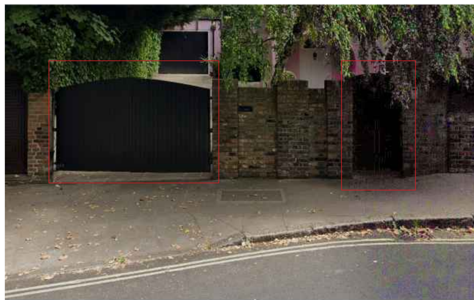
2 Timber entrance gates (to match existing)