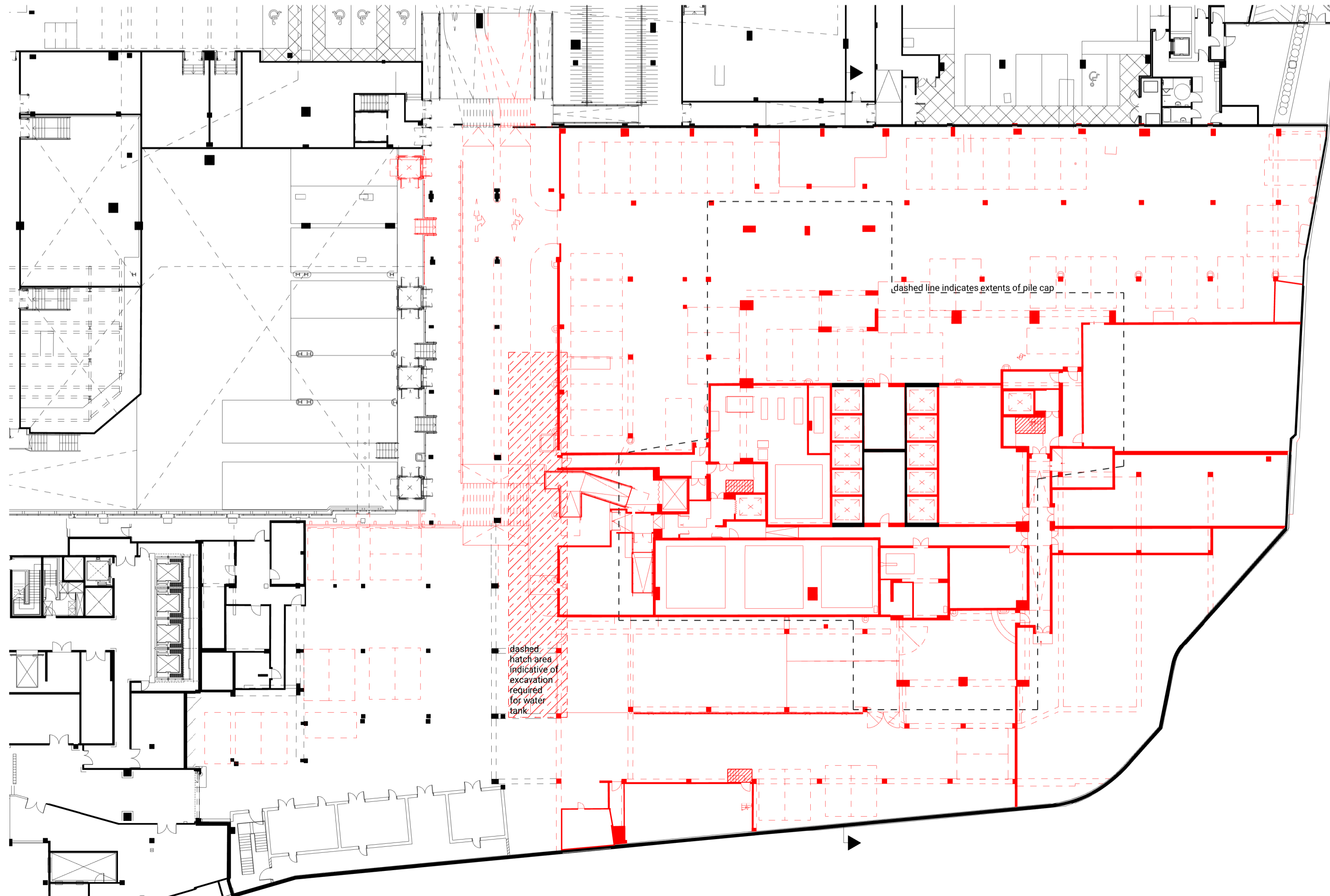
2 Phase 1 - Deconstruction Plan - Basement 1:300 @ A1