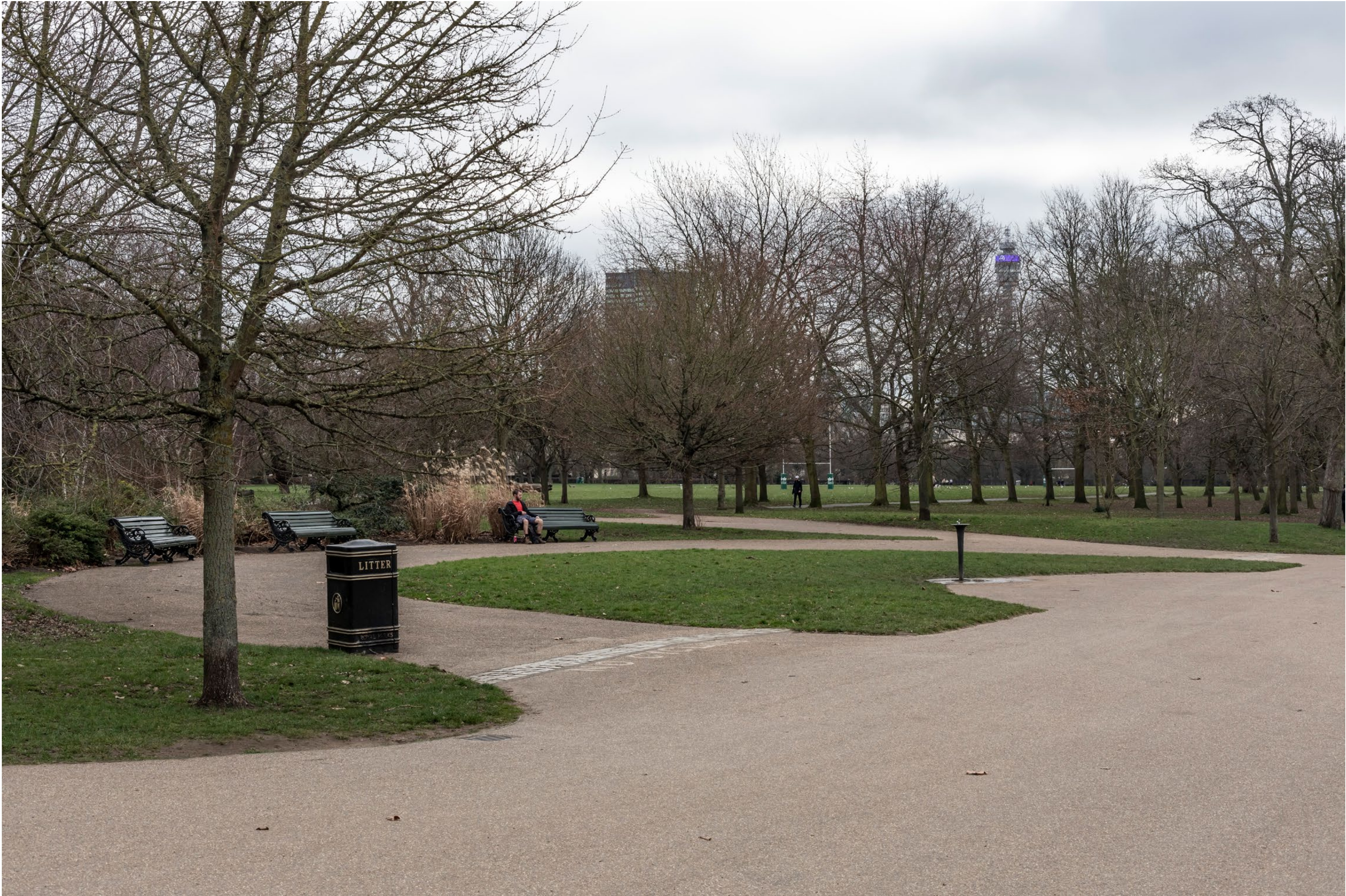
50mm – 19.8°