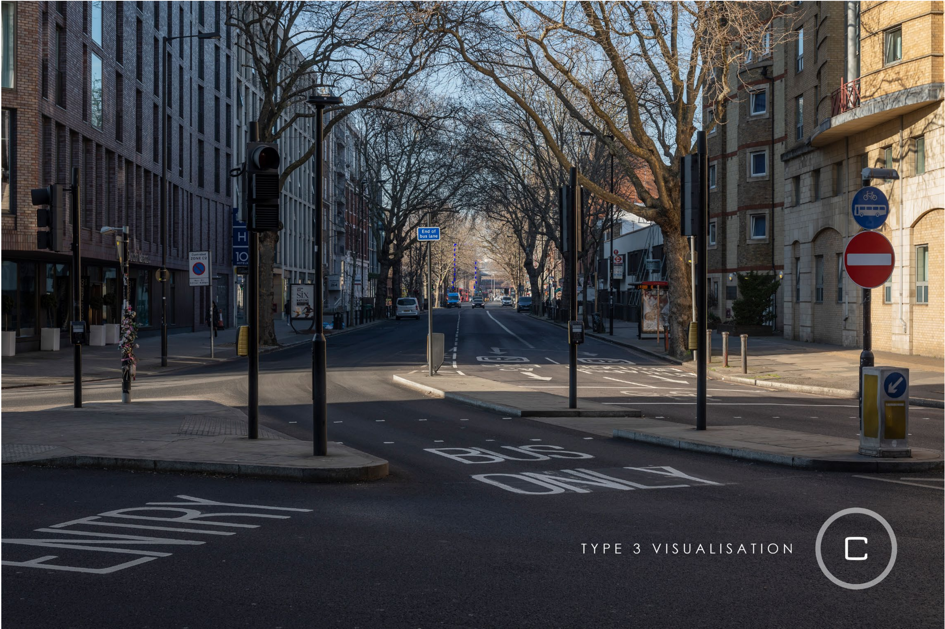
50mm – 19.8°