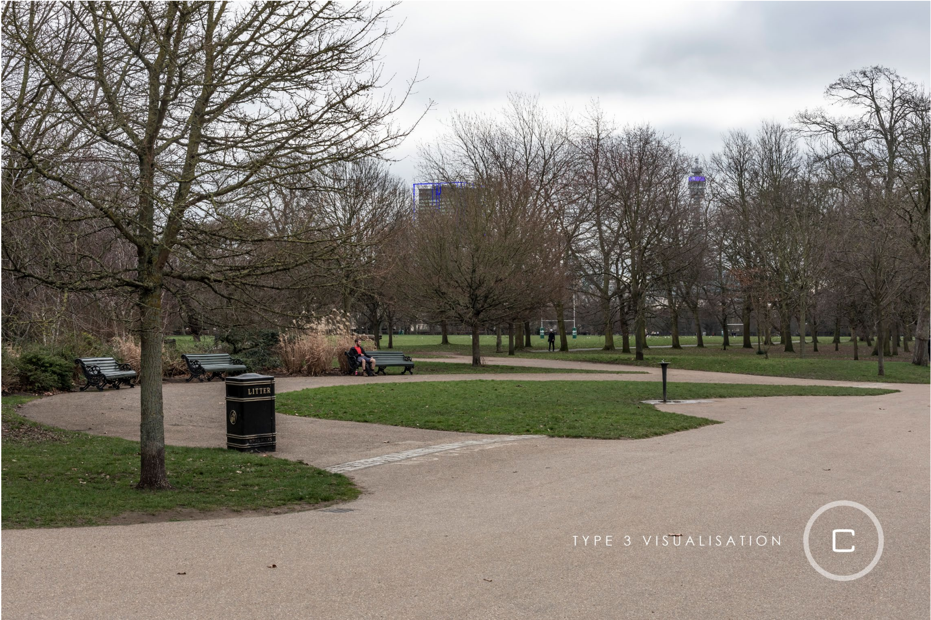
50mm – 19.8°