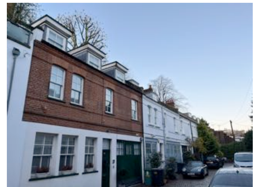
3x larger dormers next door at no.3

RevA: 12.12.24: dormer windows reduced in size, planters removed