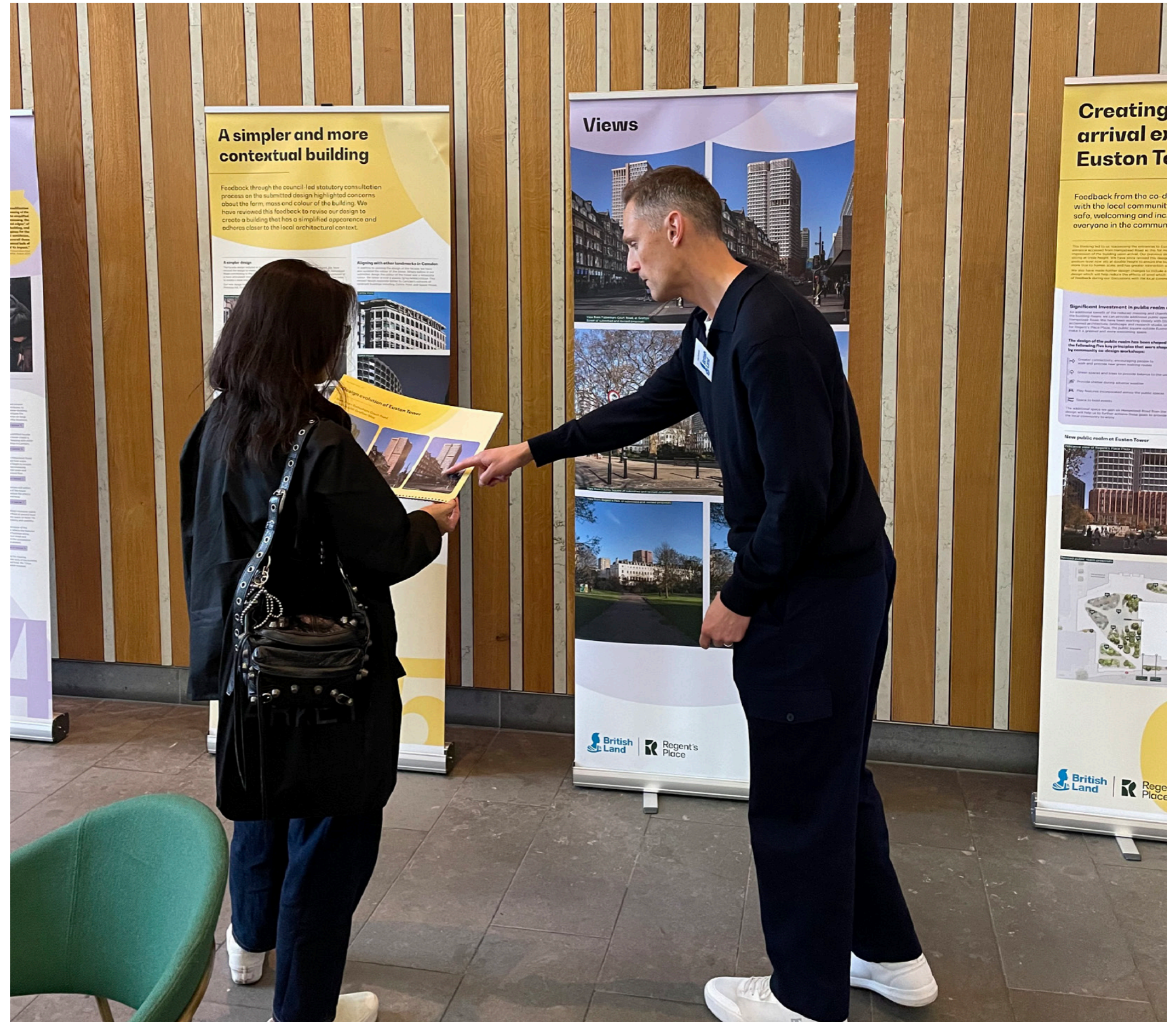
Photograph - Community Update Event

More information about the co-design process can be found in the Statement of Community Involvement (SCI) Addendum.