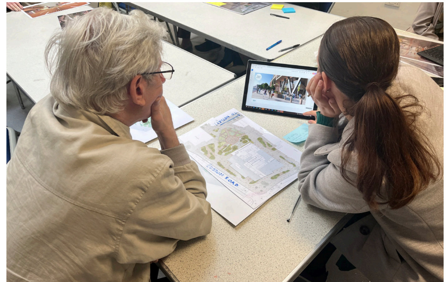
Photographs - Netley Primary School workshop