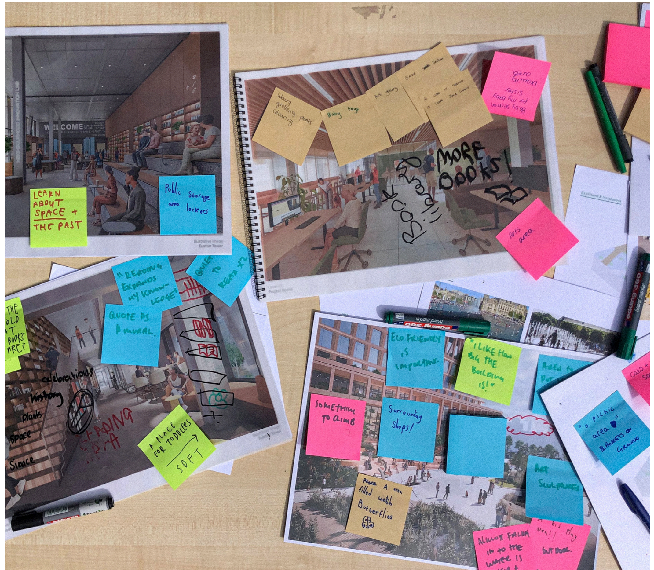
Photograph - Netley Primary School workshop table set up with interactive elements to document attendee input