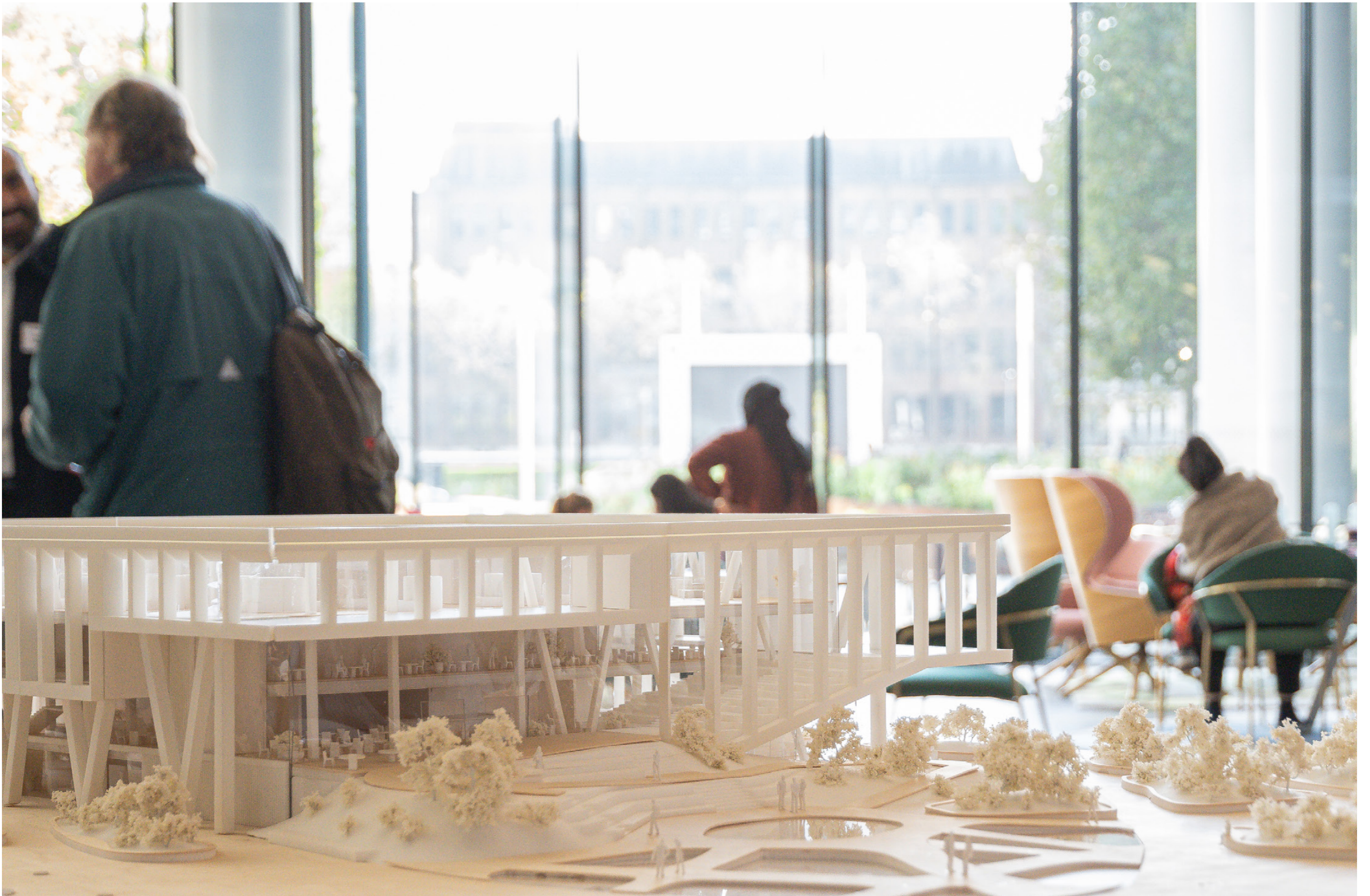
Photograph - Public Engagement Event