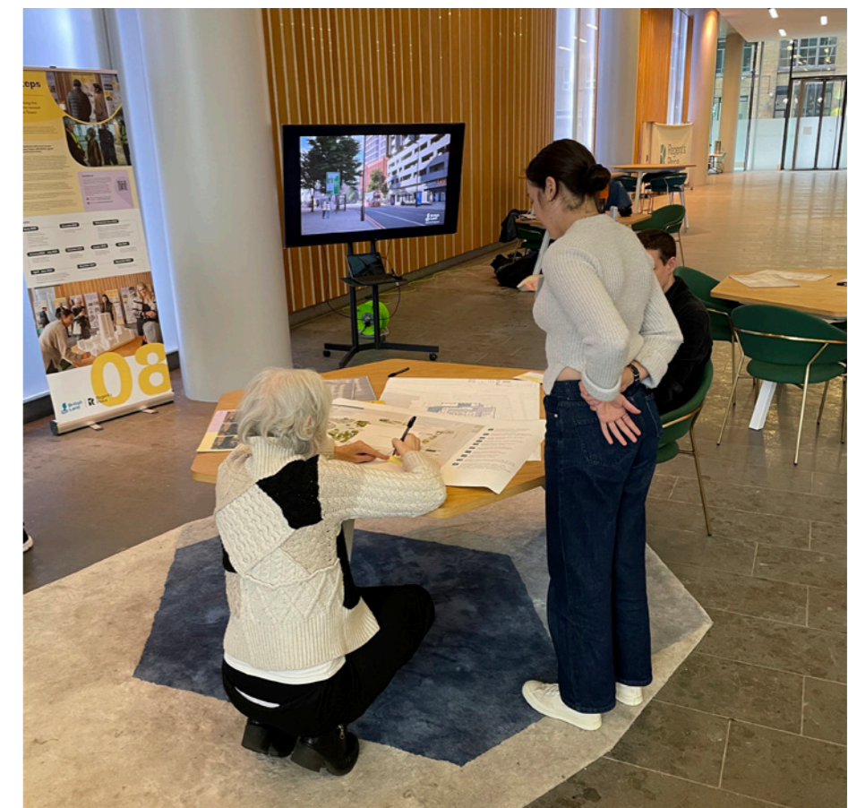
Please refer to Euston Tower online website www.euston-tower.co.uk for more information on exhibition boards presented. Proposal boards used at the Community Update Events