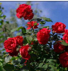
RED ROSES APPROX HEIGHT 1000mm