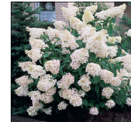
HYDRANGEA PANCICULATA APPROX HEIGHT 1200 - 1800mm