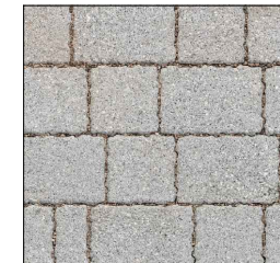
PERMEABLE BLOCK PAVING MARSHALLS GARDEN LIGHT (LT) 229mm x 229mm 229mm x 355mm