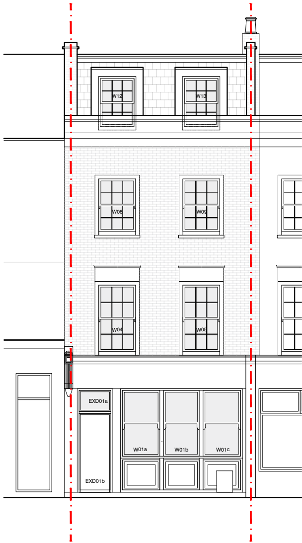
1 EXISTING ELEVATION PR.AL.300 SCALE 1.100 @ A3