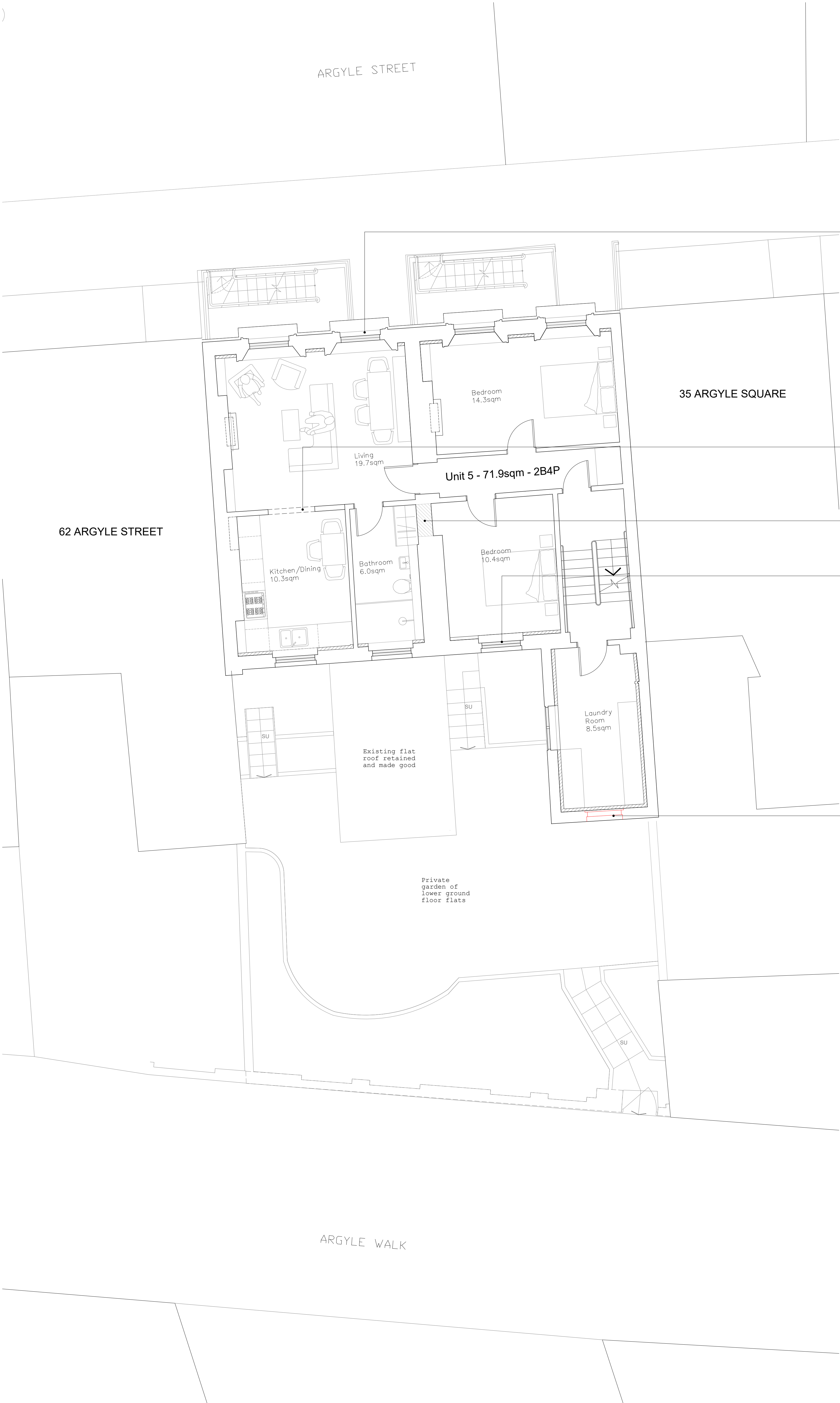
First Floor - 1 x 2B2P