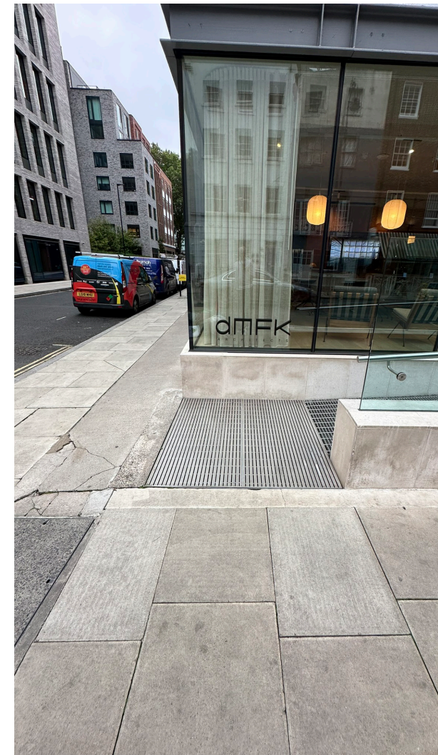
CHARLOTTE STREET - Existing ramp access