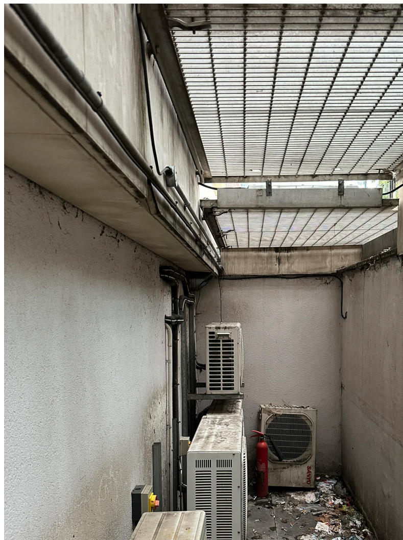
CHARLOTTE STREET - Internal view of lightwell