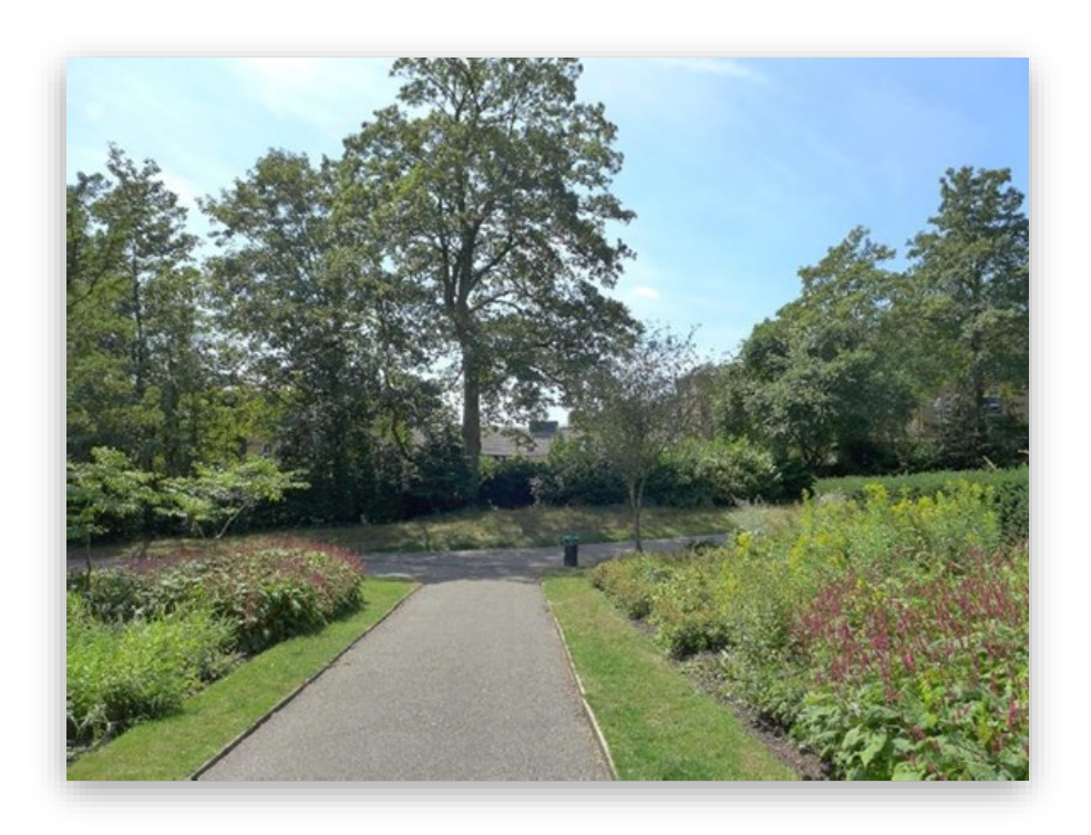
Image 4: Direct view from Waterlow Park Screening perverting views of the building and detract from the proposed secure garden