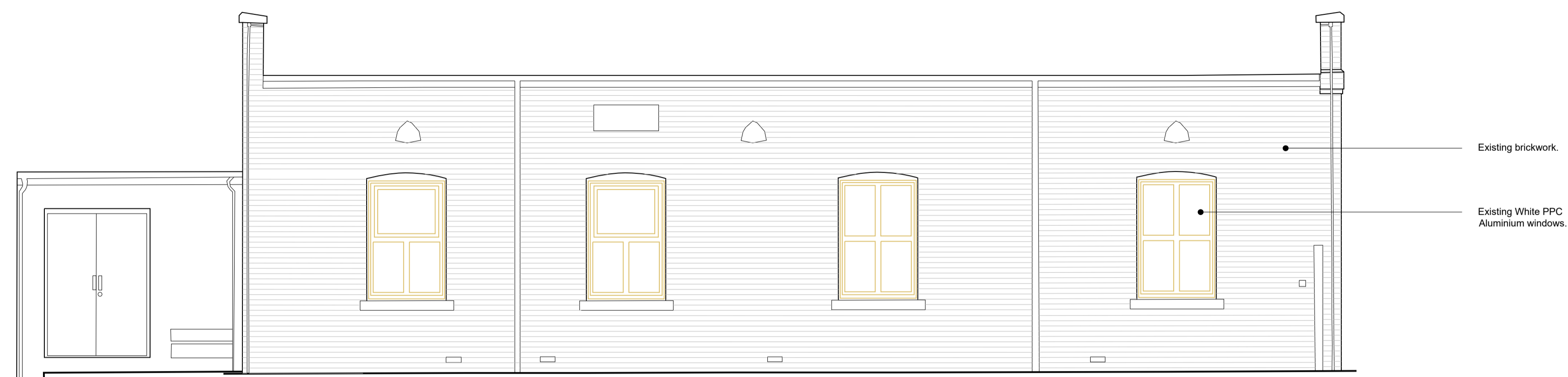
Existing South Elevation Scale 1:50