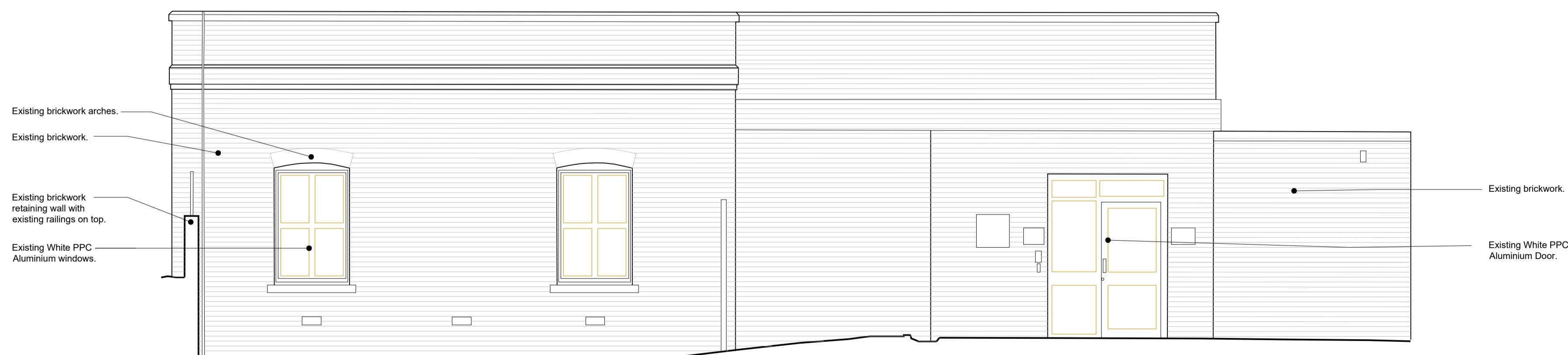
Existing North Elevation Scale 1:50

All information on the drawing is indicative and is subject to a topographical and measured survey, once complete the drawing will be updated