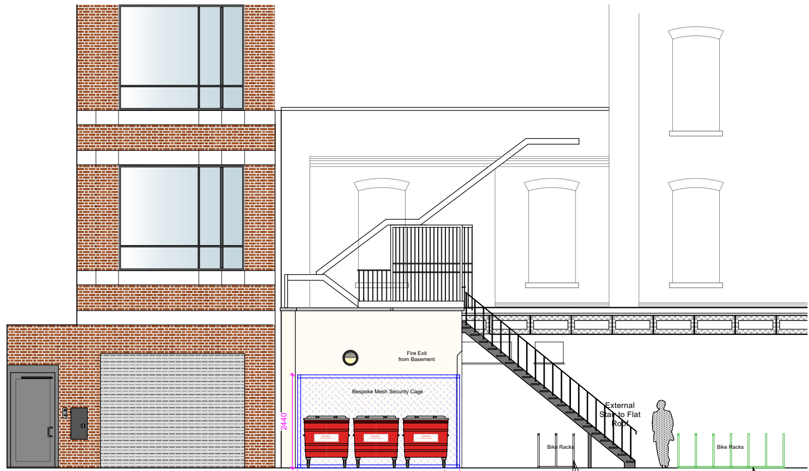
PROPOSED ELEVATION A

6-Slot free-Standing Bike Rack to be relocated to Position Indicated