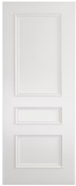
sample image of internal doors

Note: × This drawing must not be re-issued, loaned, printed or copied without the designer's prior consent. × DO NOT SCALE FROM THIS DRAWING OTHER THAN FOR THE PURPOSES OF PLANNING - use figured dimensions only. Any discrepancies are to be reported to designer immediately. × Before any work commences, all dimensions to be checked and verified on site. All boundaries to be confirmed between the the client and contractor and no part of the building is to overhang or undermine boundary lines without prior written consent.