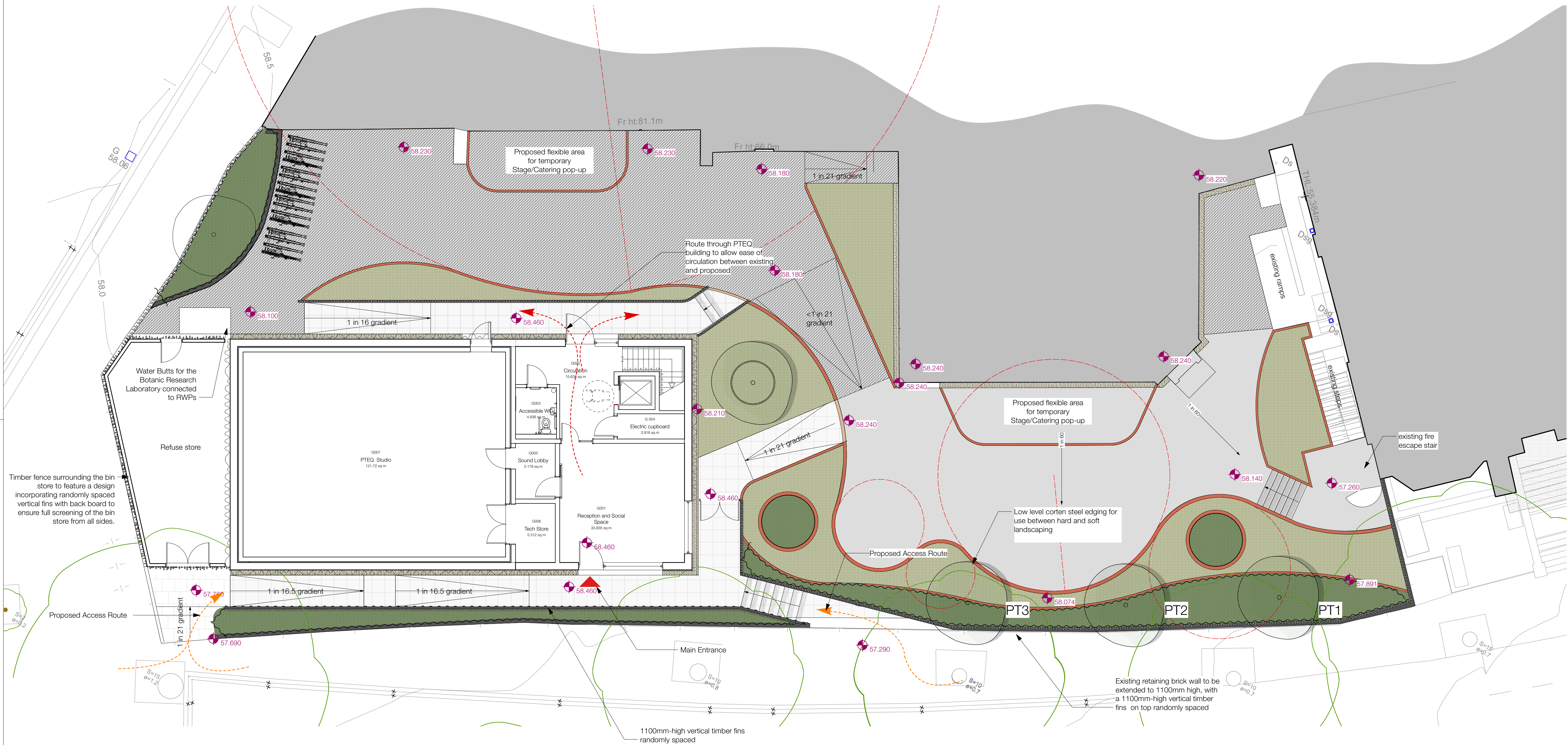
Proposed Landscape Design Scale: 1:100