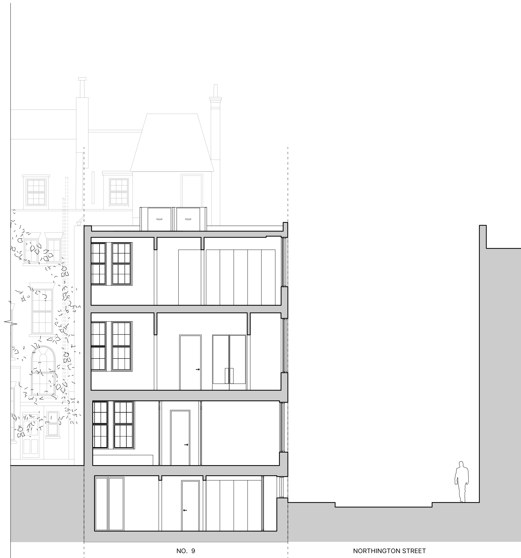
EXISTING SECTION AA

THIS DRAWING IS TO BE READ IN CONJUNCTION WITH ALL RELATED ARCHITECTURAL DRAWINGS, REPORTS AND OTHER RELEVANT INFORMATION.