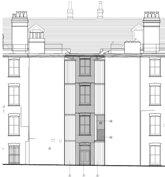
Figure 3. Extract of proposed lightwell

An example of how the proposed scheme will sit within a lightwell is depicted at Figure 3.