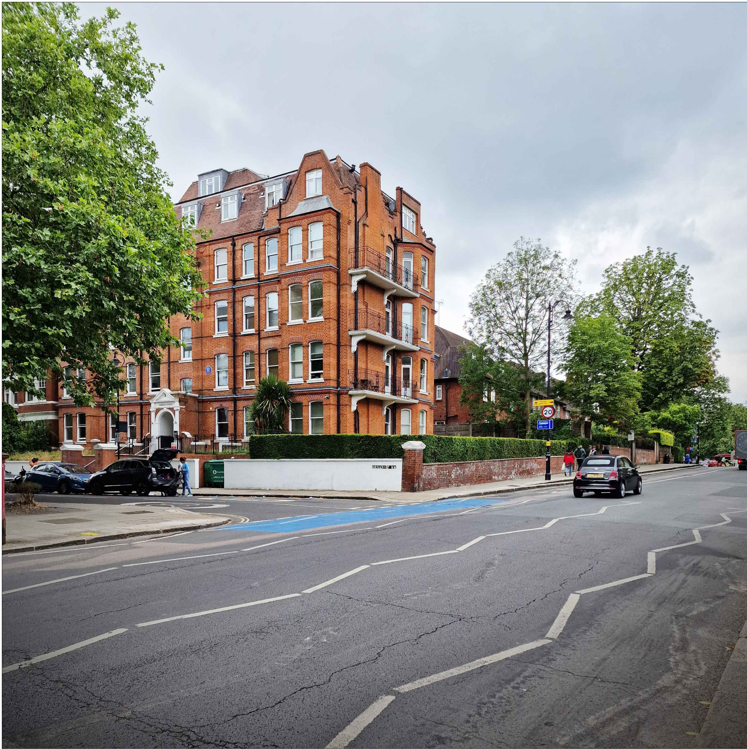
01 Existing View 01 NTS