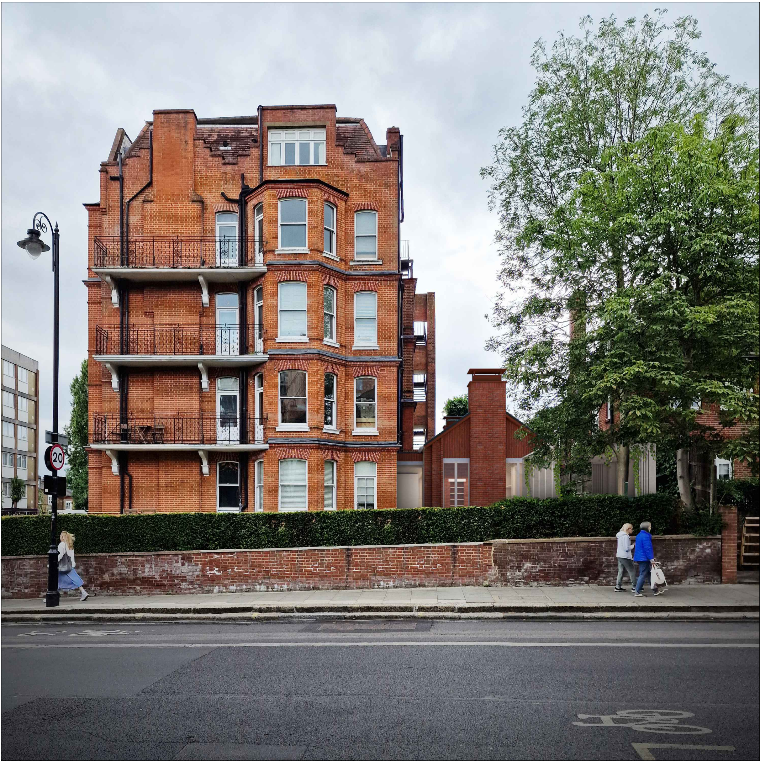
02 Proposed View 01 NTS