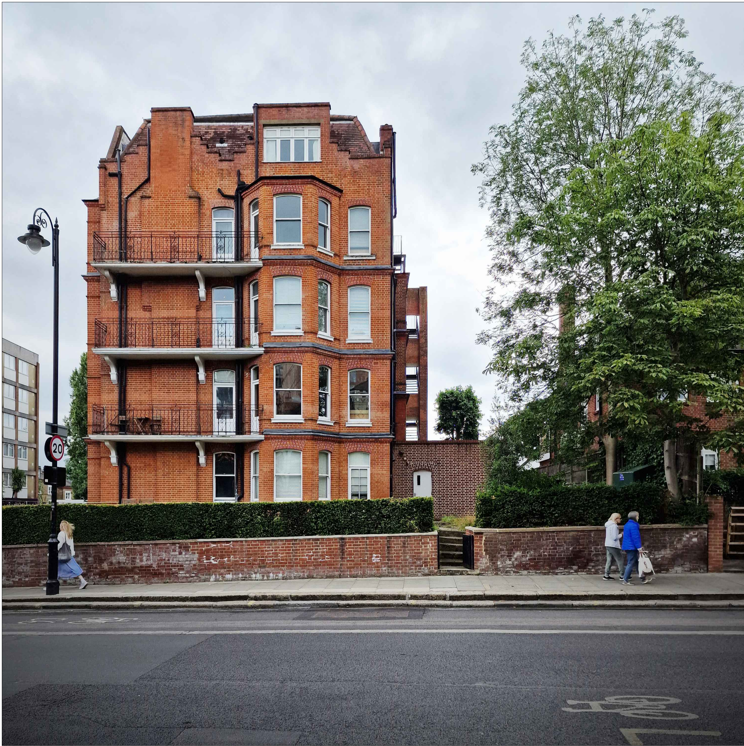
01 Existing View 01 NTS