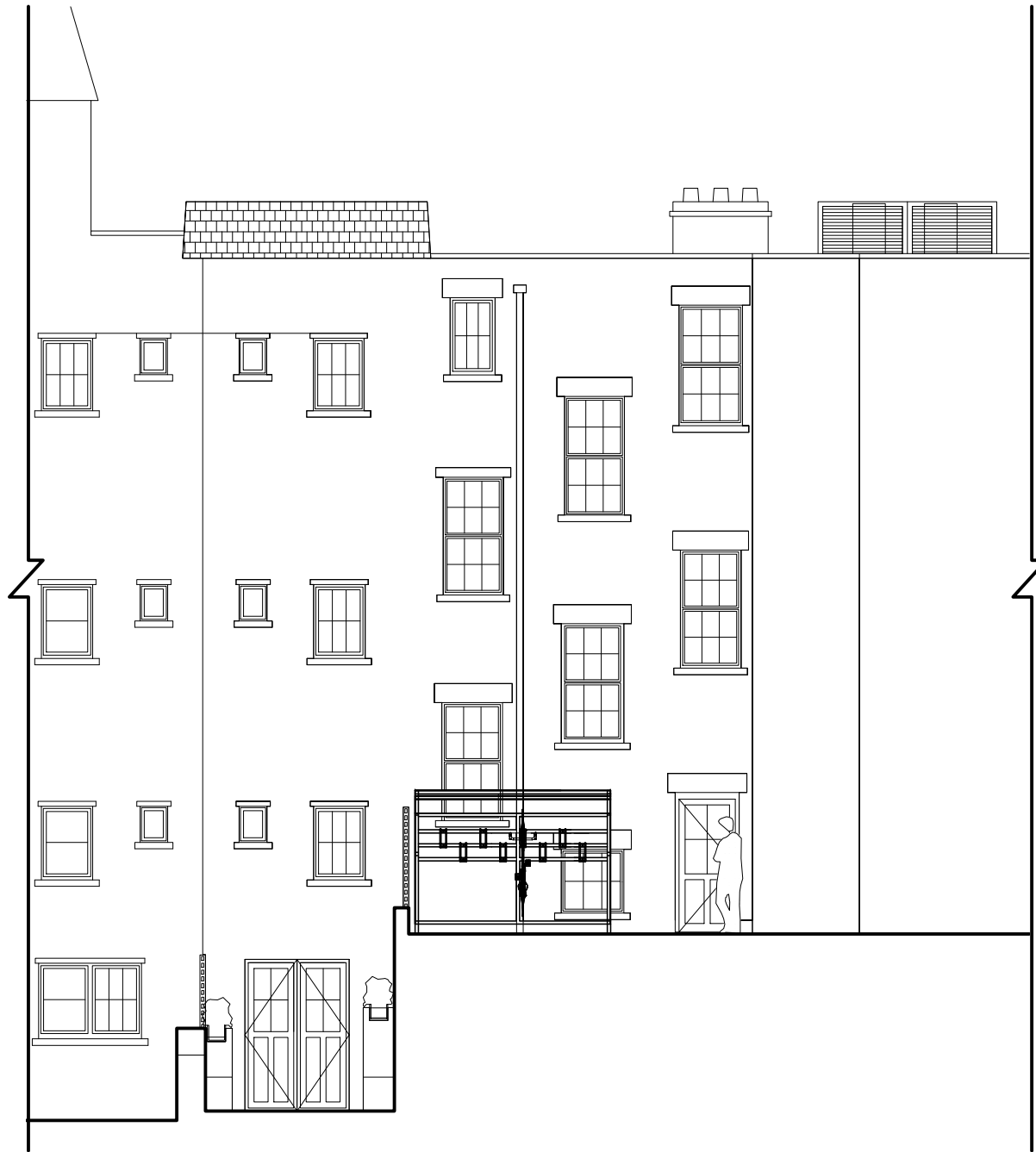
1:100 SOUTH ELEVATION

THIS DRAWING IS TO BE READ IN CONJUNCTION WITH ALL RELATED ARCHITECTURAL DRAWINGS, REPORTS AND OTHER RELEVANT INFORMATION.