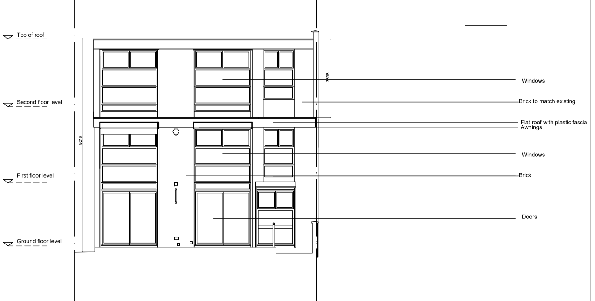
Rear (South) Elevation