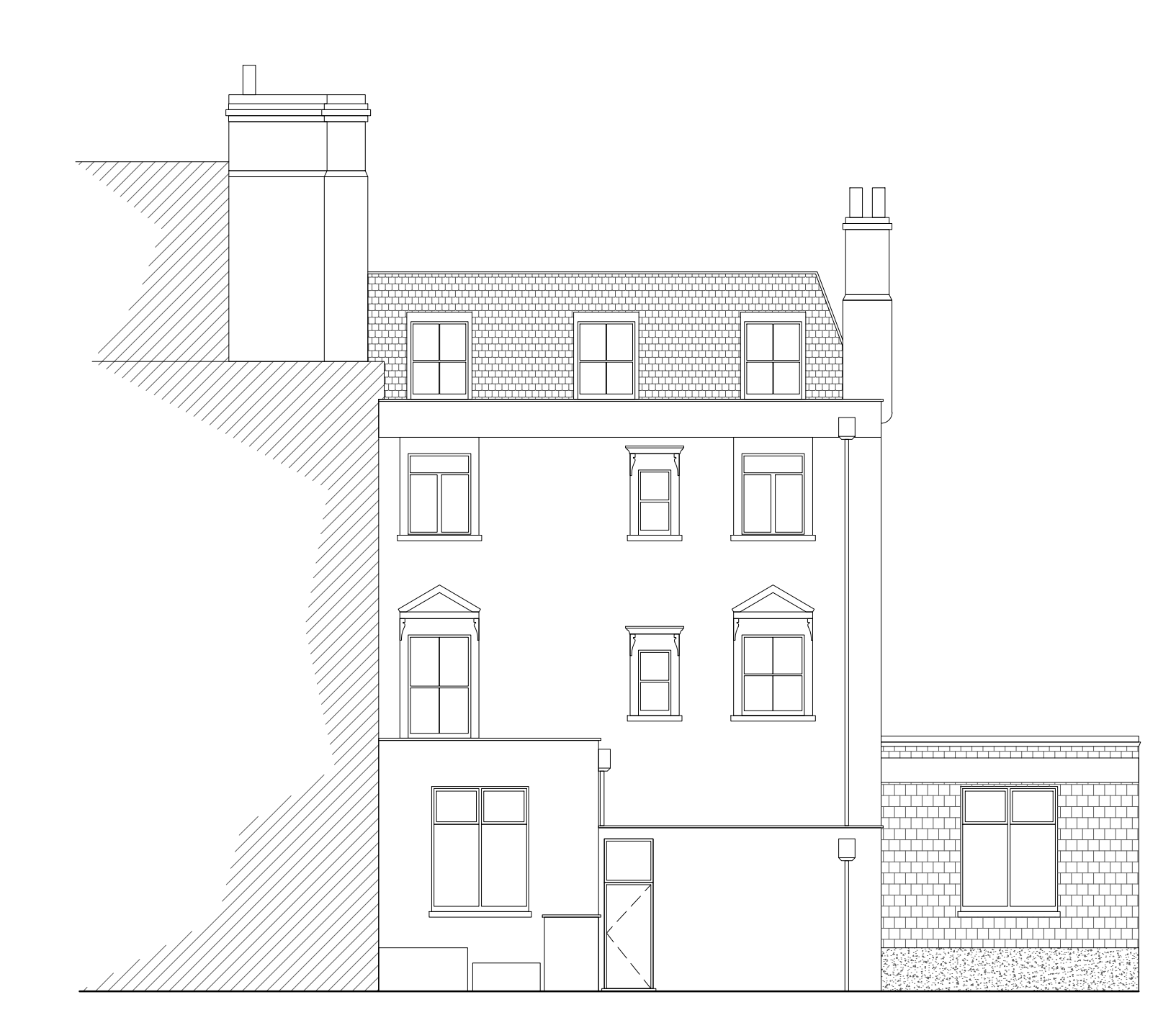
EXISTING REAR ELEVATION SCALE 1:100@A1