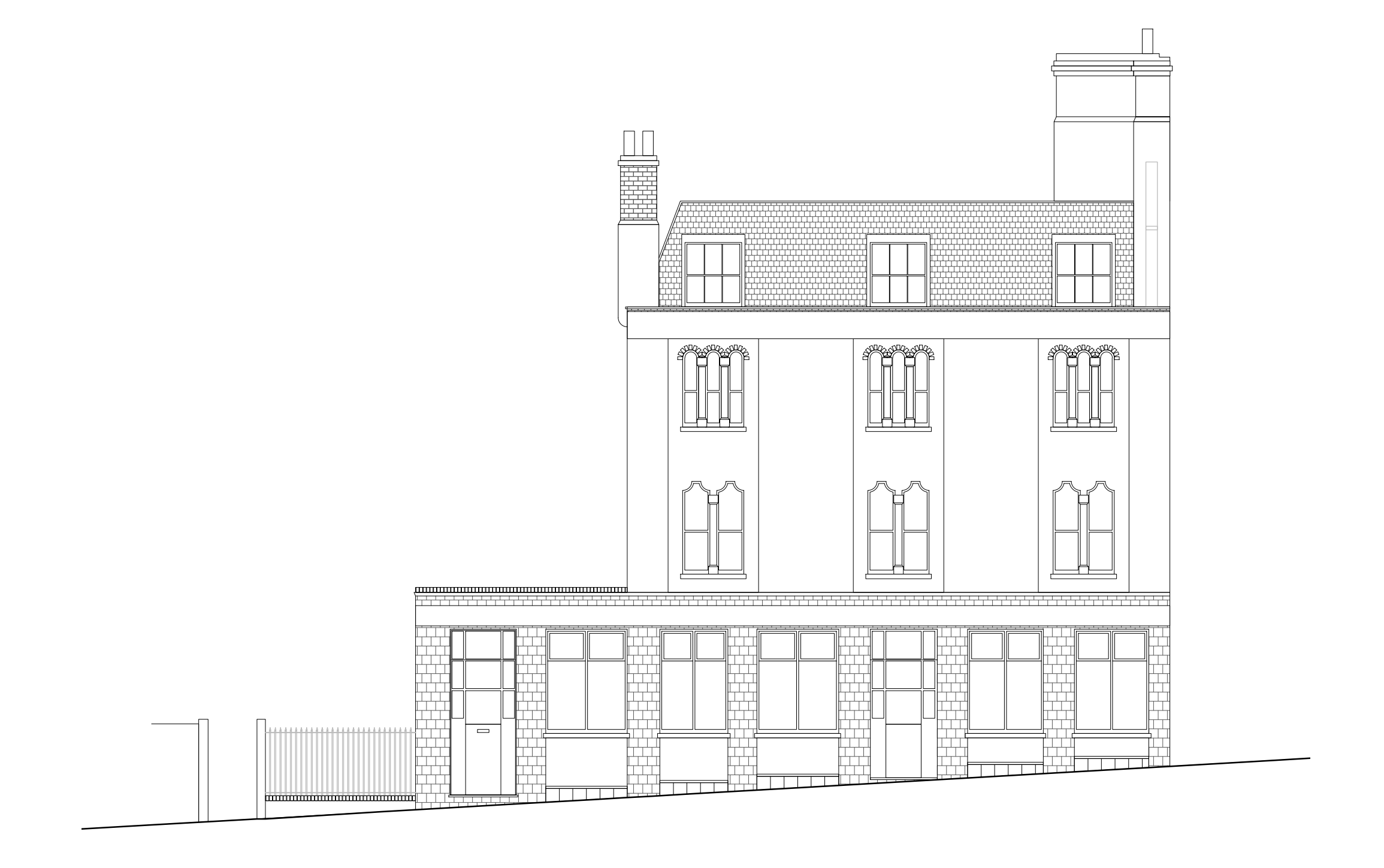
EXISTING FRONT ELEVATION SCALE 1:100@A1