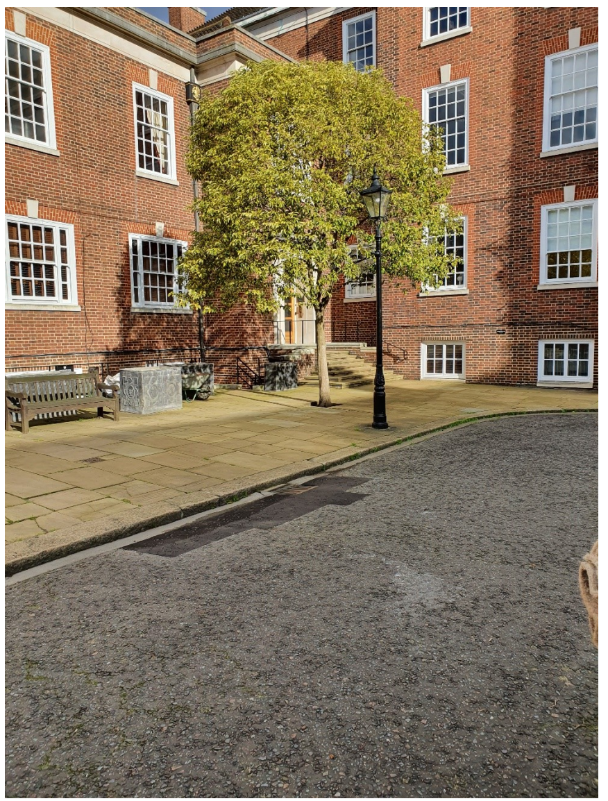
Figure 1 T1 Chinese Privet ~ South Square