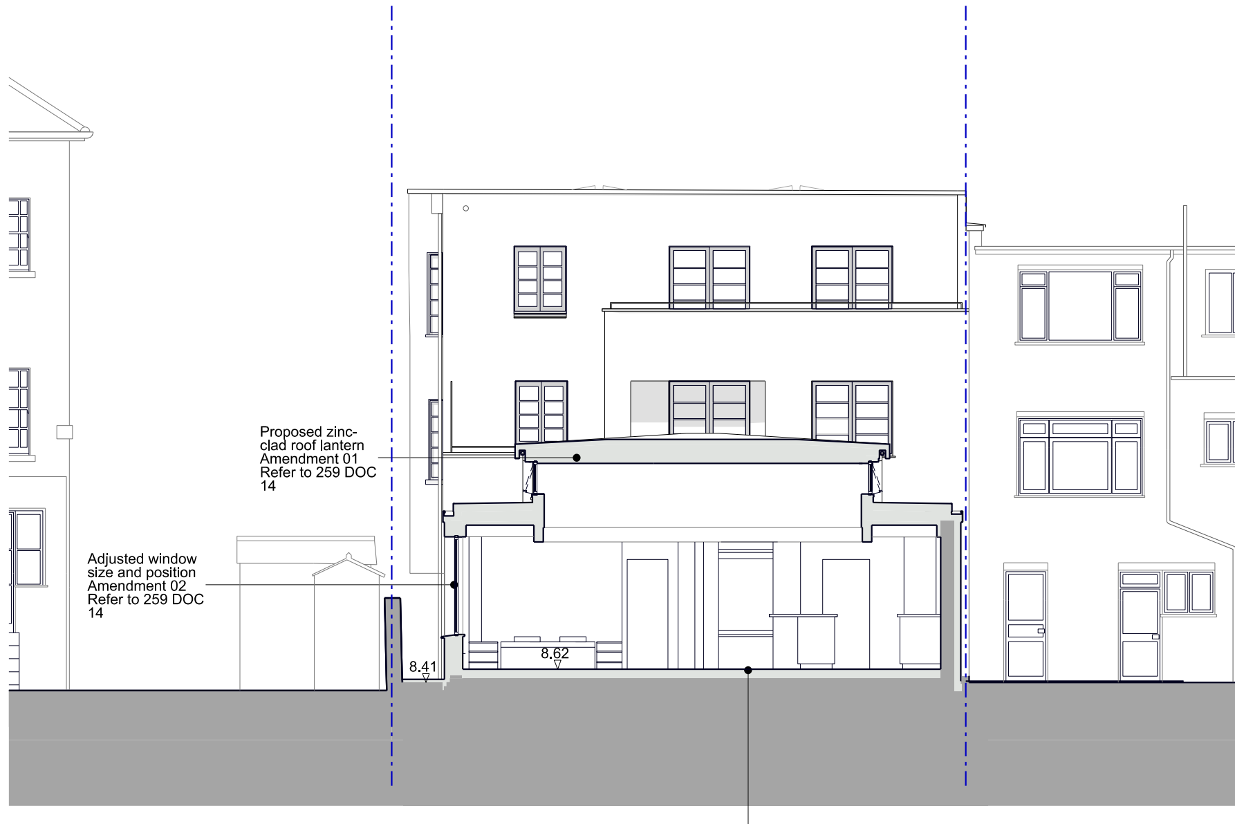
As Proposed Section DD

Existing slab retained and overlaid with insulation and underfloor heating