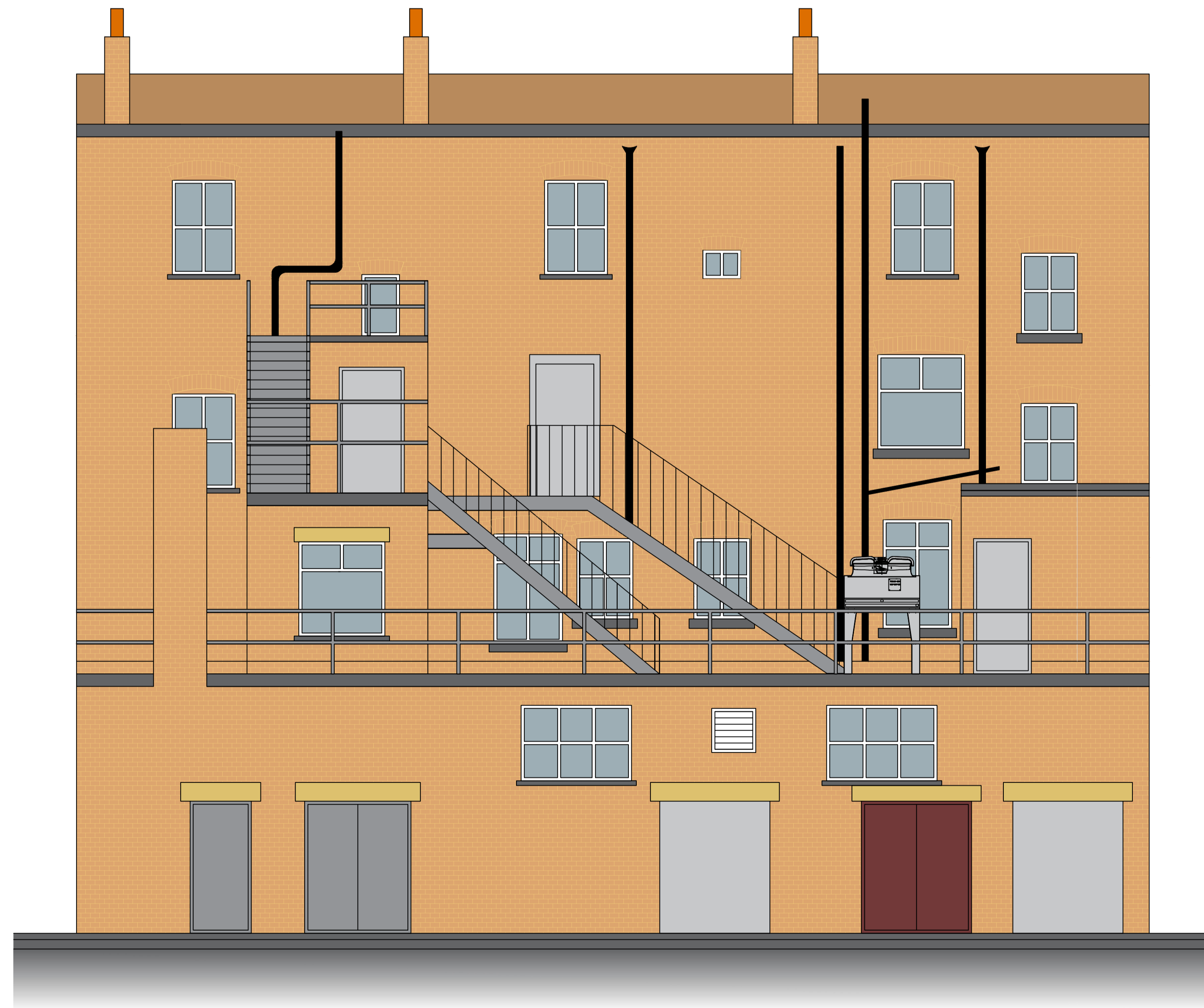
EXISTING WEST ELEVATION SCALE (1:50 @ A1)